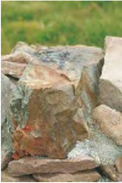
Greenstone from Aberfoyle.