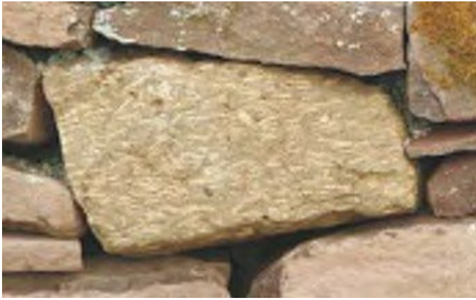
Carnethy Porphyry from Carnethy Hill, Pentlands.