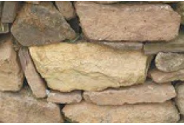
Burdiehouse Limestone from Almondell Country Park, West Lothian.