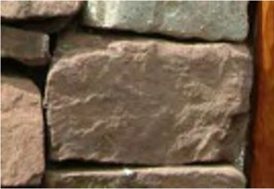
Yellow Sandstone from St. Mary's Academy, Bathagte.