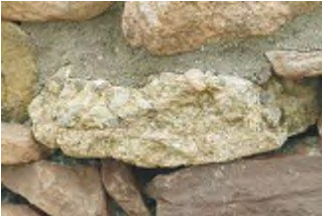
Conglomerate from Craigmillar Castle, Edinburgh.