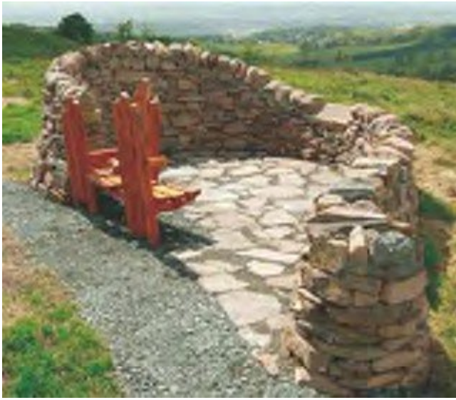
Witch Craig Wall.