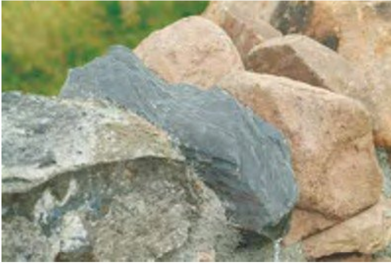
Slate from Aberfoyle.