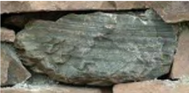
Greywacke Shale from the Southern Uplands.