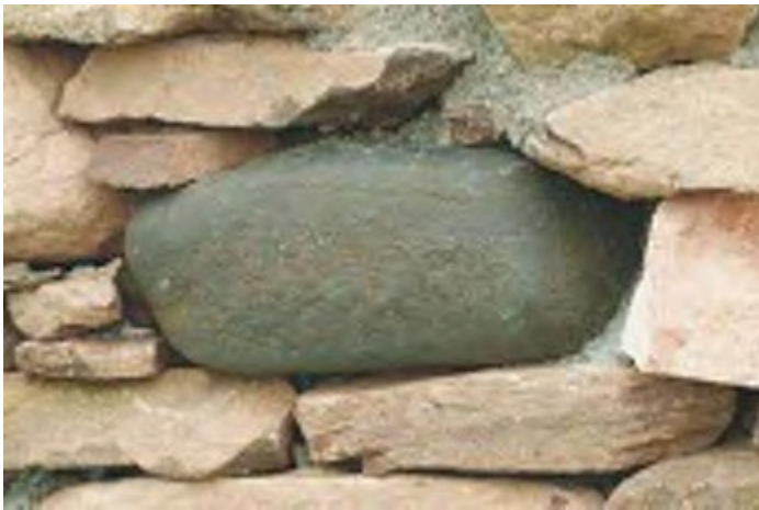
Basalt cobble from the shore at Queensferry.