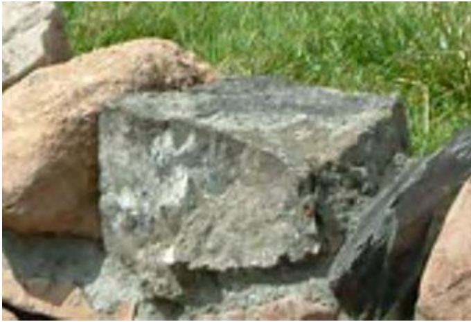
Fossiliferous limestone from Wairdlaw (just northeast of Witchcraig).