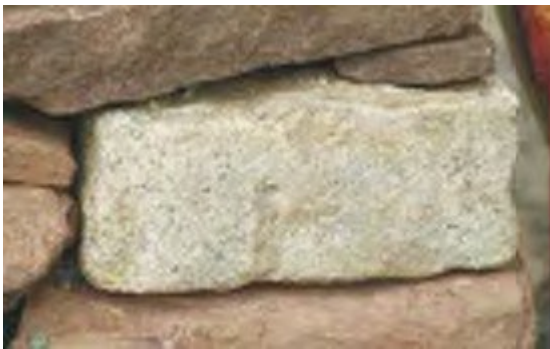
Granite from Arran.