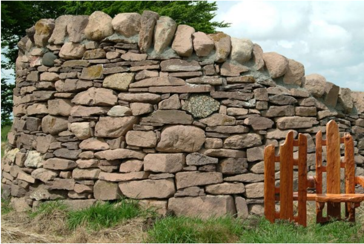
Witch Craig Wall.