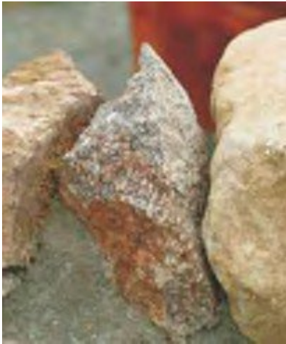
Basalt from Markle Quarry in the Garleton Hills, East Lothian.