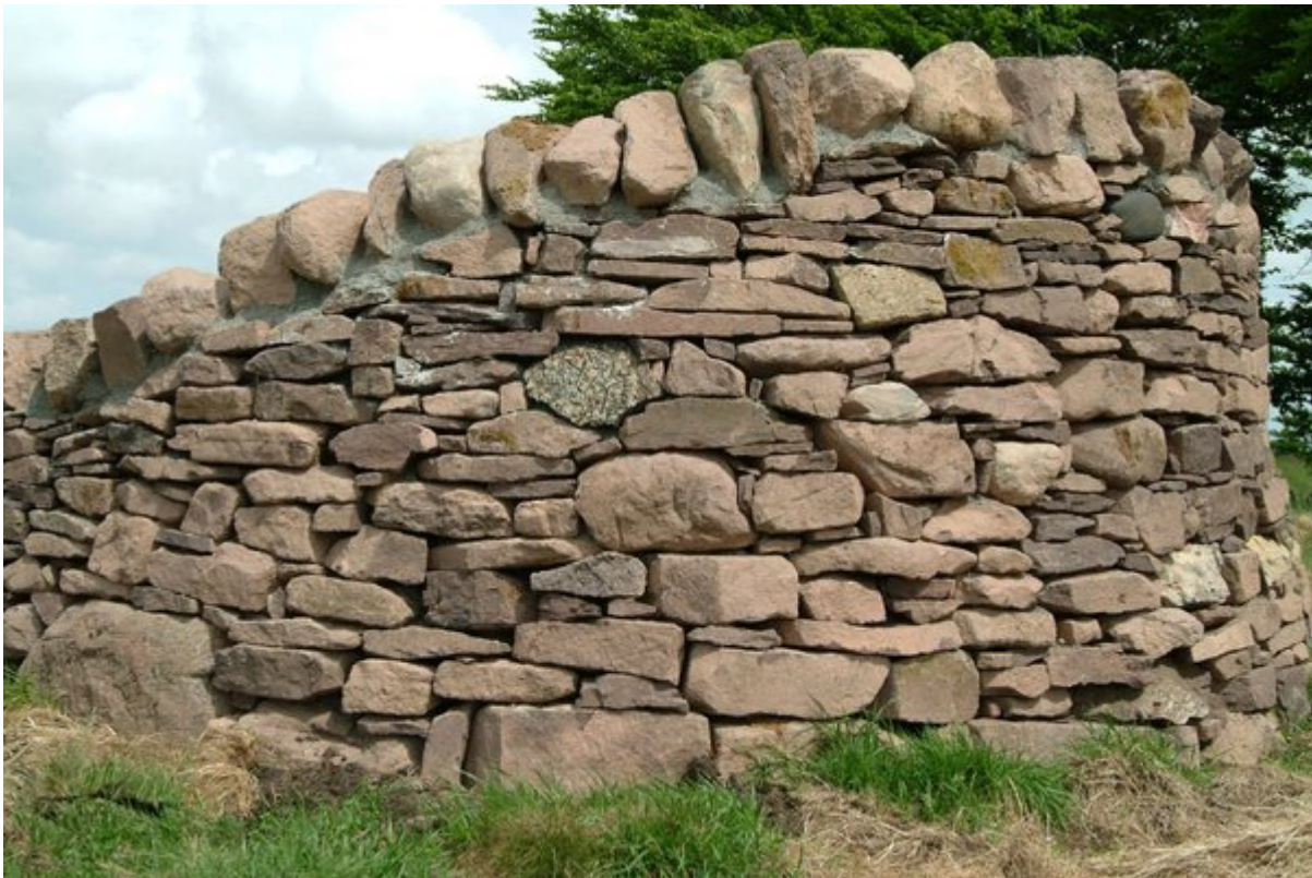
Witch Craig Wall.