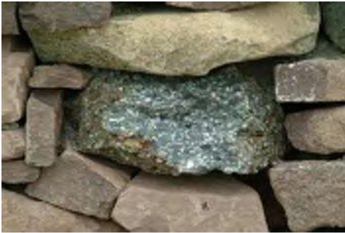
Haggis rock (Greywacke) from the Southern Uplands.