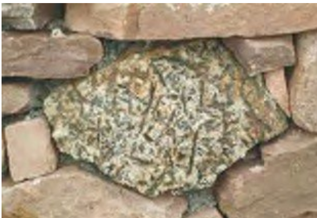
Gabbro (Teschenite) from Craigie Hill (near the Forth Bridges).