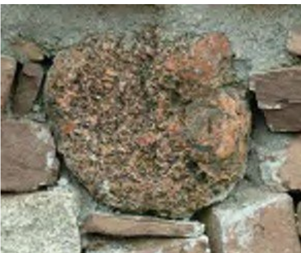
Spent Shale from Oakbank.