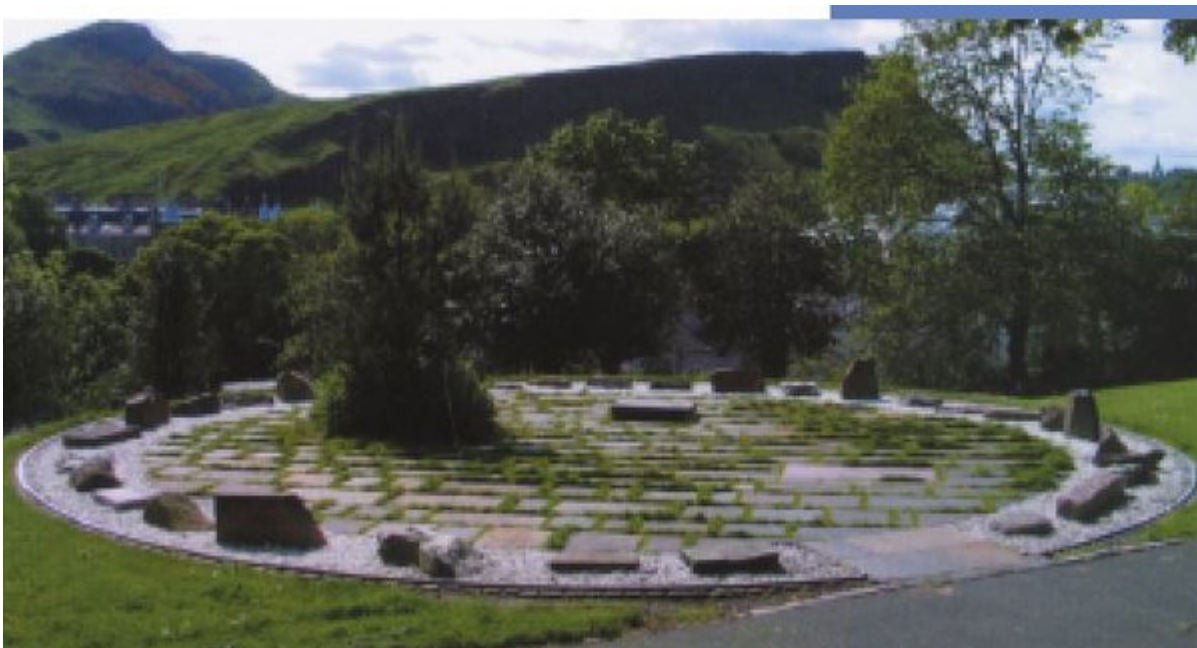
(Figure 1) Stones of Scotland.