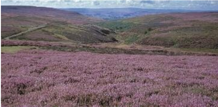
Middleton Common. Heather moorland on outcrop of Namurian Rocks.