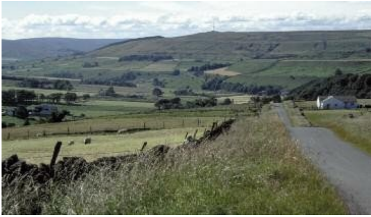
Characteristic terraced hillside, Blagill, Nent Valley.