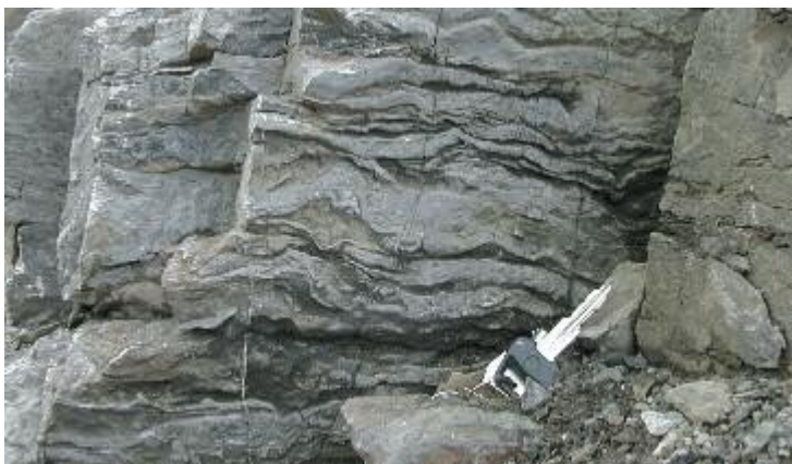
Chaetetes Band, River Nent, Nenthead Mines.