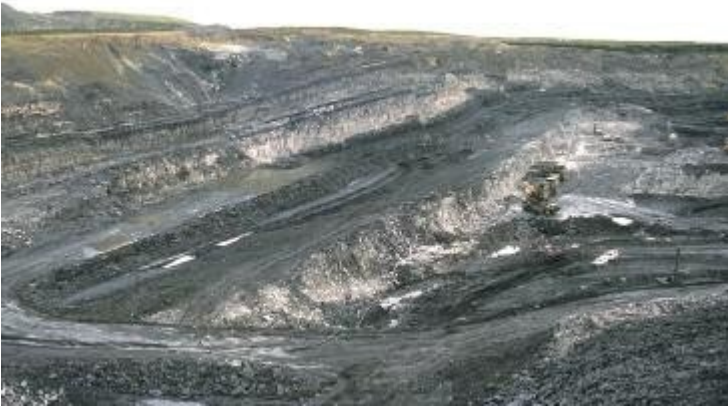
Plenmeller Opencast Coal Site in 1980's.