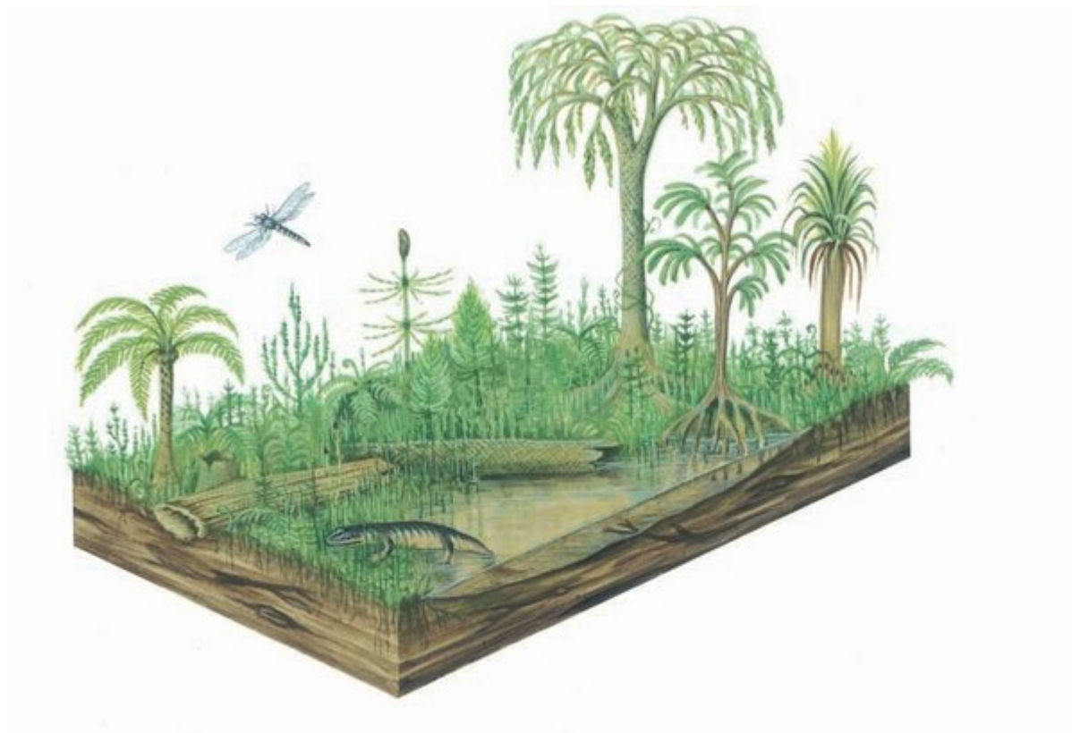
Carboniferous swamp.