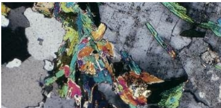
Photomicrograph of thin section of Weardale Granite © H. Emeleus, Durham University.