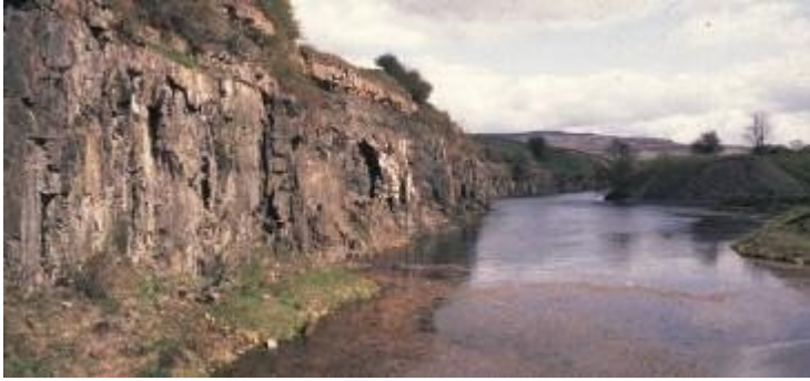
The Little Whin Sill exposed in the abandoned Greenfoot Quarry, Weardale.