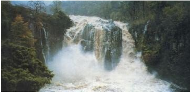
High Force, Whin Sill overlying Tynebottom Limestone.