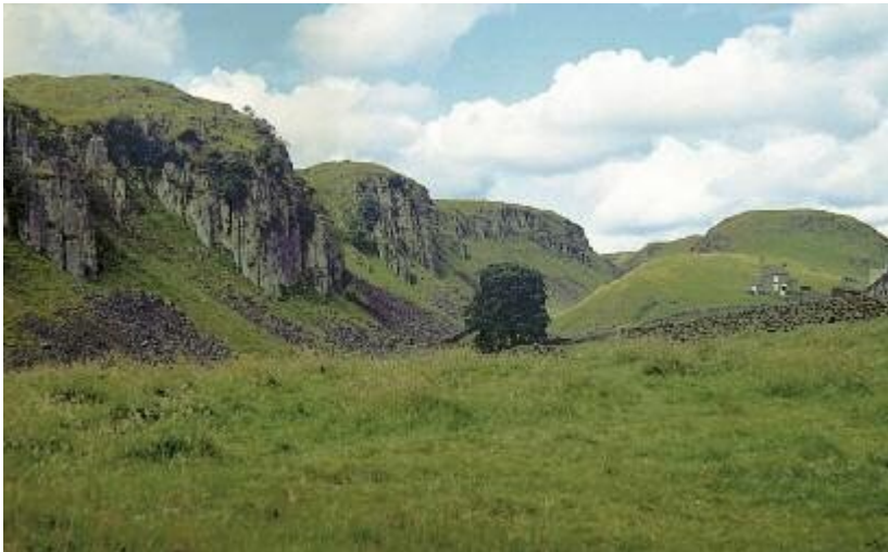
Crags of columnar jointed Whin Sill, Holwick Scar, Teesdale © BGS, NERC.