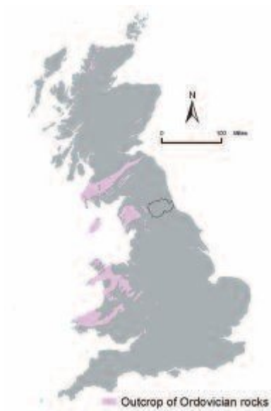
(Figure 7) Distribution of Ordovician rocks in Great Britain.