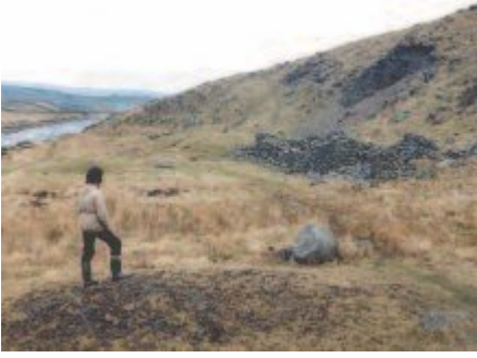
(Photo 1) Cronkley Pencil Mill, Teesdale. Old quarry in Ordovician Skiddaw Group slates, formerly worked for making slate pencils.