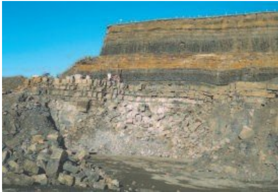
(Photo 2) Heights Quarry, Eastgate, Weardale. Great Limestone and overlying shales and sandstones.