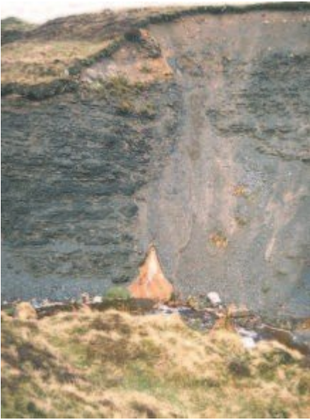
(Photo 4) Namurian shales exposed in North Grain, Rookhopehead, Rookhope. An iron-rich spring flows from a fault cutting the shales.