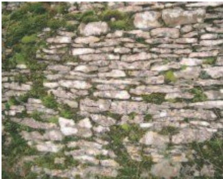
(Photo 85) Drystone wall built of limestone as host to a variety of lichens and mosses. God's Bridge, Bowes Moor.