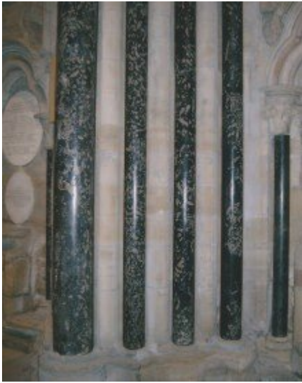
(Photo 83) Durham Cathedral. Polished columns of Frosterley Marble contrasting with Coal Measures Sandstone in the Chapel of the Nine Altars. B Young, BGS, ©NERC, 2004.