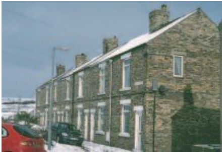
(Photo 84) Helmington Row, near Crook. Pale grey bricks produced from Coal Measures fireclay.