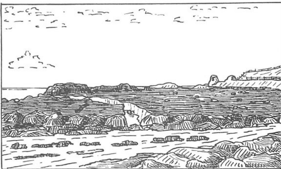
(Figure 12) The St Monans Neck seen across the St Monans Burn. The level wave-cut platform is underlain by tuff, while the trench marks the site of a dyke-like vent intrusion. In the background are sea stacks of tuff, dark, and sandstone beyond the neck, light in colour.