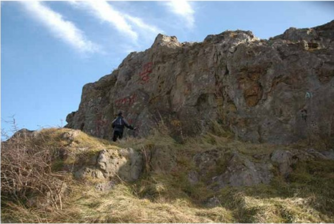
(Plate 5) Ford Formation Ref Limestone at Tunstall Hill.