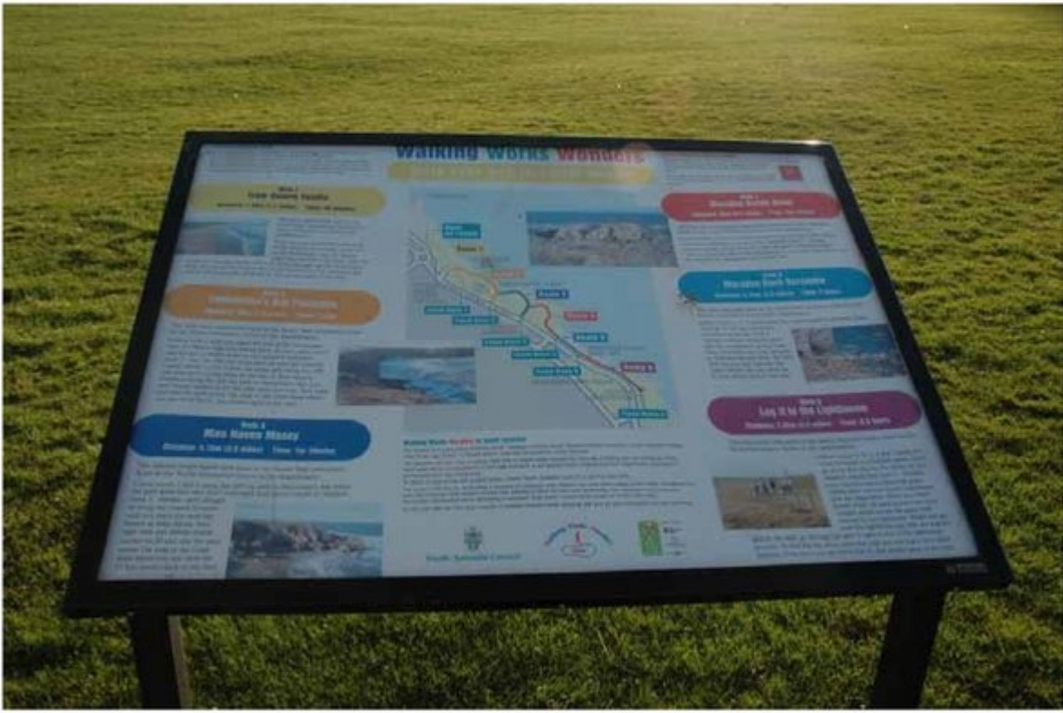
(Plate 23) 'Walking Works Wonders' board south of Lizard point.