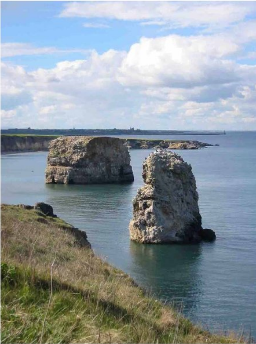
(Plate 9) Coastal stacks in the Roker Dolomite Formation seen from Lizard Point.