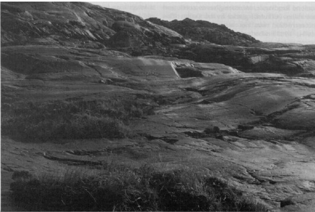
(Figure 11.4) Detail of ice-moulded bedrock near Loch Coruisk showing glacially abraded and smoothed stoss slopes and localized joint-block removal.