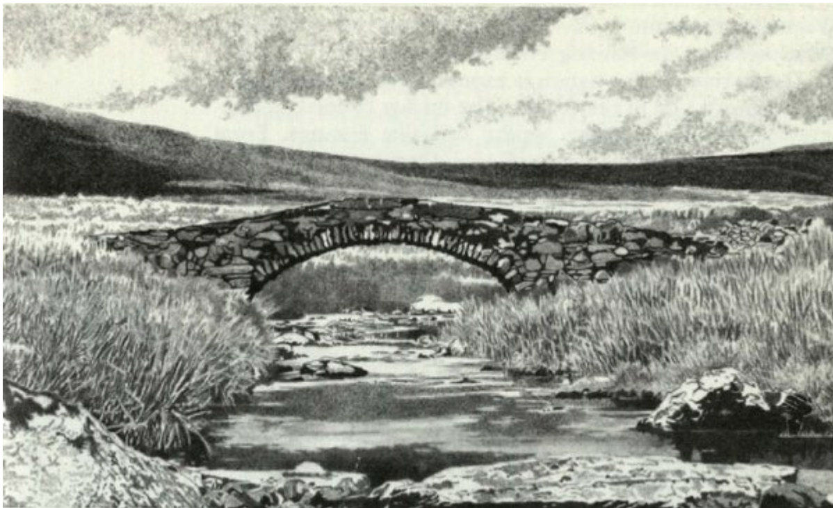
(Figure 31) Sketch of Pont Scethin.