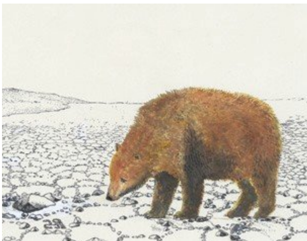
(Figure 10) Cave bear.