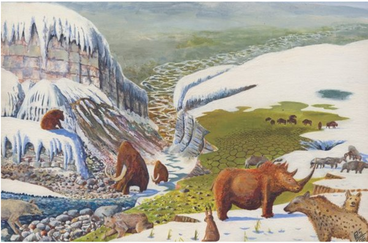
(Figure 11) A diorama of ice-age life in the Mendips.