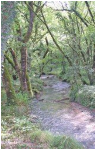
(Figure 84) The Whatley Brook flowing through Asham Woods. The stream here is augmented by pumping from Torr Works.