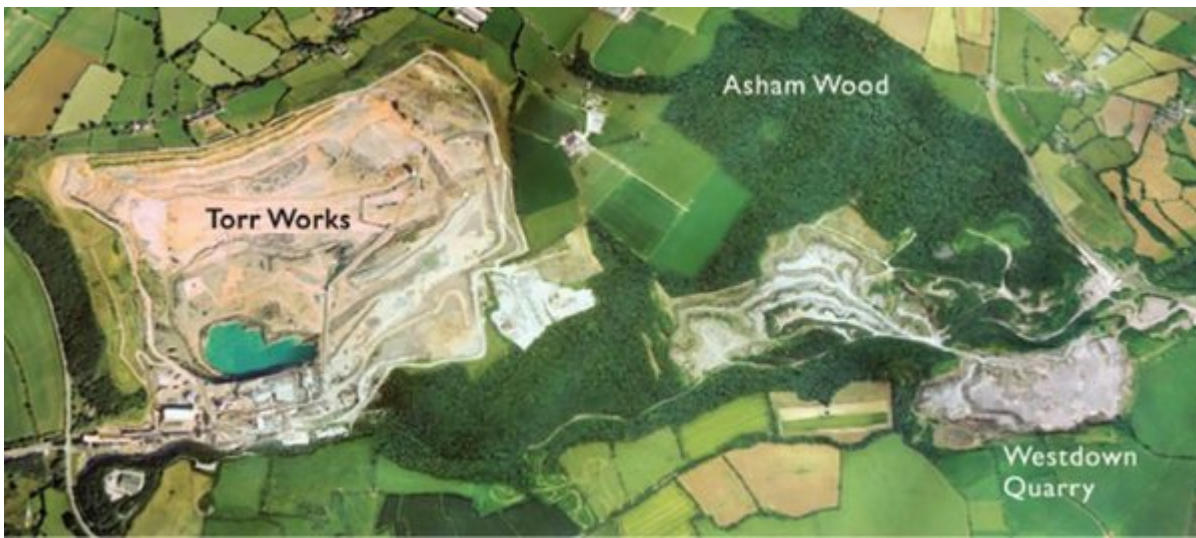
(Figure 81) Aerial photograph of the Torr Works and Asham Wood area.