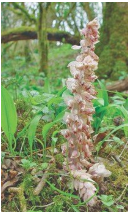
(Figure 87) Example of toothwort.