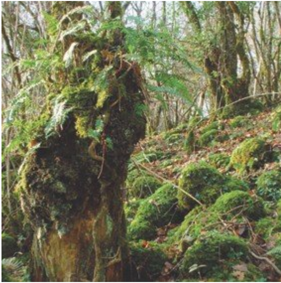
(Figure 85) Polypody ferns on oak stumps, Asham Wood.