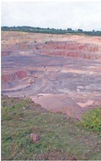
(Figure 82) Torr Works Quarry.