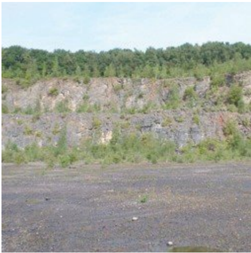
(Figure 86) Asham Quarry.