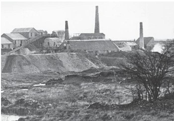
(Figure 84) St Cuthbert's Lead Works, in the Priddy Minery, c. 1903.