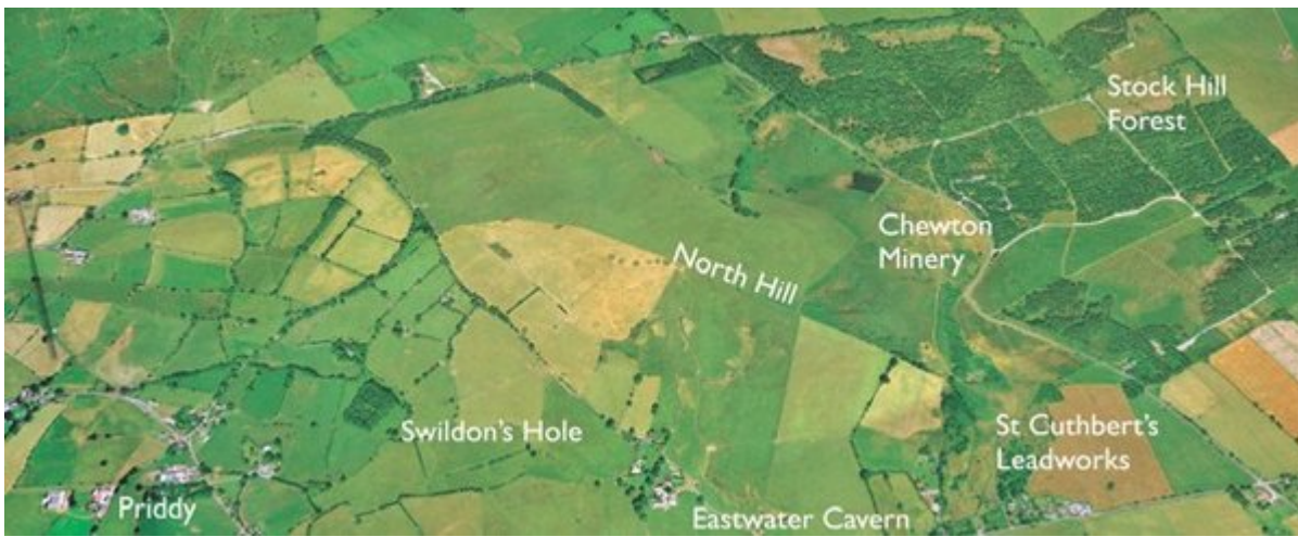
(Figure 80) Aerial photograph of the Priddy area.