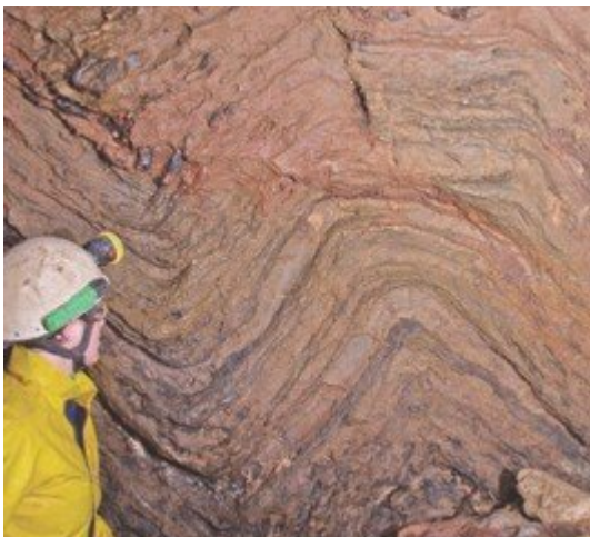
(Figure 82) Folding in the Black Rock Limestone, Swildons Hole.