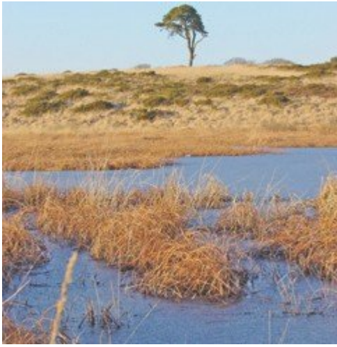
(Figure 85) Waldegrave Pool.