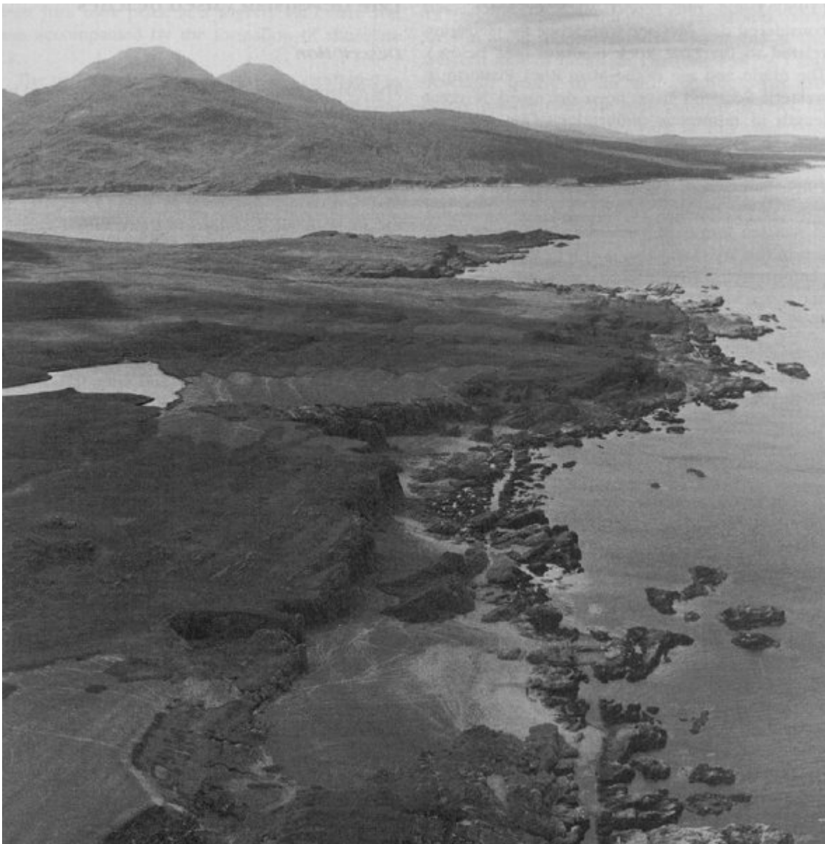
(Figure 11.12) View south along the west coast of Jura between Shian Bay and Ruantallain. Lateglacial shingle ridges extend across a high rock platform and to the west of Loch a'Mhile (centre). The loch was formerly a marine inlet prior to the deposition of the shingle ridges. Note also a prominent rock platform and backing cliff (the Main Rock Platform) seaward of the high shingle ridge 'staircases'. Holocene shingle ridges also cover the Main Rock Platform.