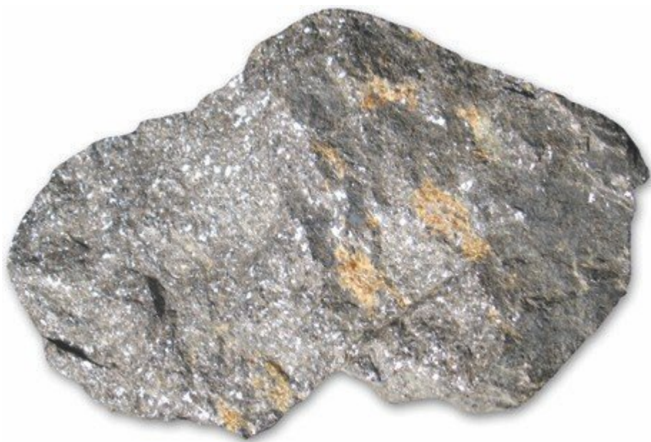
(Figure 15) An example of galena.