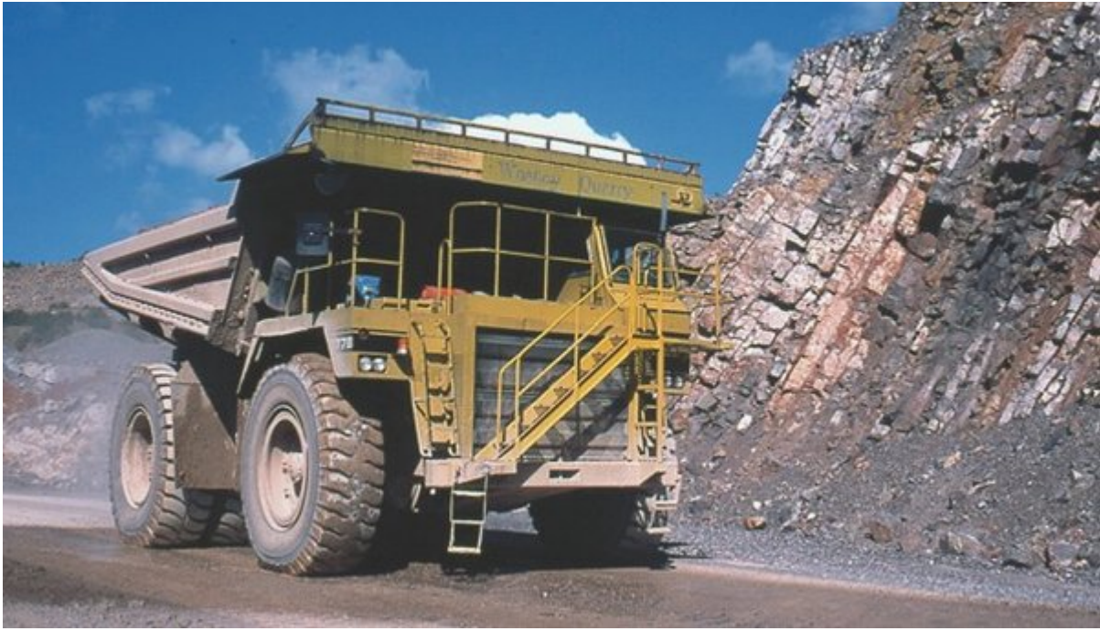
(Figure 16) Dumper truck, Whatley Quarry.