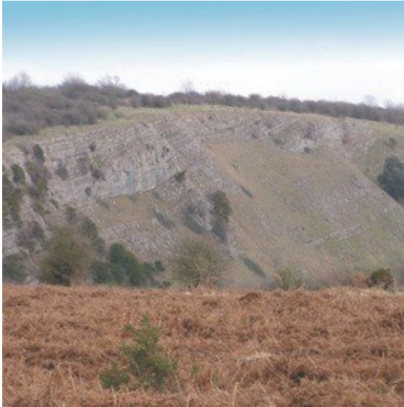
(Figure 47) The main scarp in Burrington Combe, formed of the Black Rock Limestone.