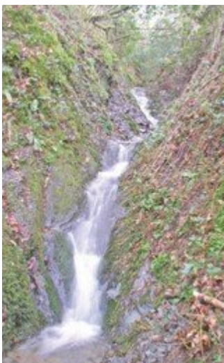
(Figure 51) The East Twin Brook, flowing off the sandstone uplands of Blackdown.