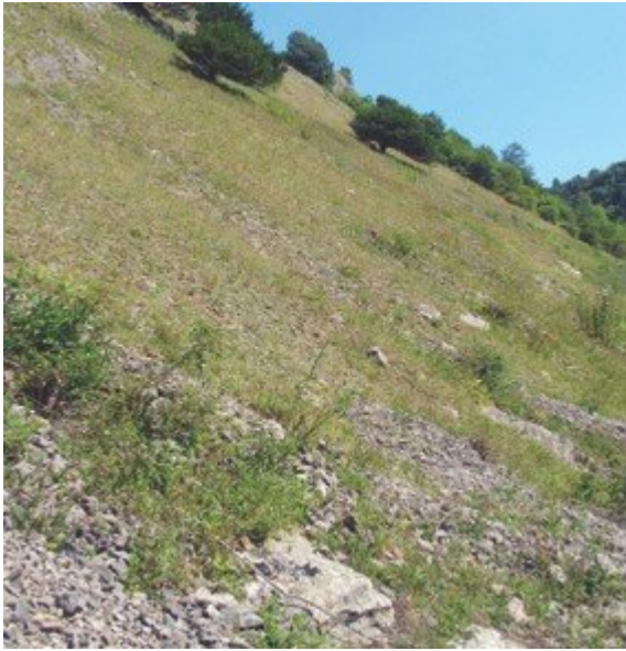
(Figure 52) The steep south-facing slope of Burrington Combe, a haven for lime-loving plants.