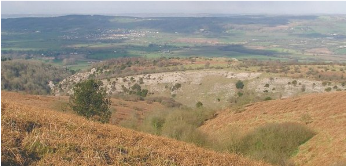
(Figure 55) View of Burrington Combe from Blackdown, overlooking the Vale of Wrington to the limestone uplands of Broadfield Down.