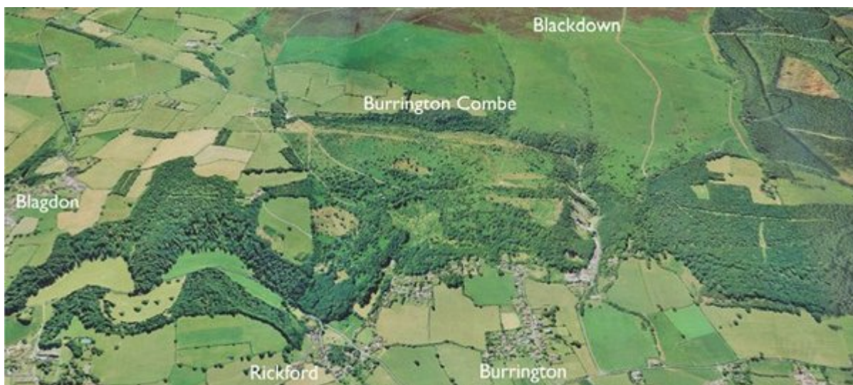
(Figure 45) Aerial photograph of the Blackdown area.

(Figure 56) Lower Carboniferous coral ( Palaeosmilia murchisoni ).