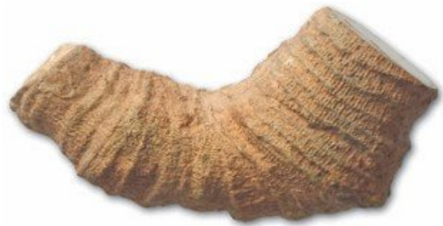
(Figure 56) Lower Carboniferous coral ( Palaeosmilia murchisoni ).