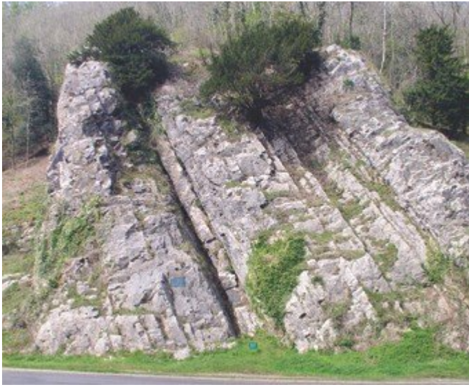
(Figure 46) The 'Rock of Ages', a crag of Burrington Oolite. The story of the Rev. Toplady sheltering here, prompting his famous hymn, is probably not true.