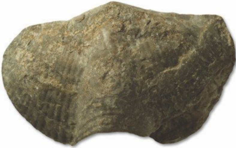
(Figure 53) Fossil brachiopod Syringothyris, common in the Black Rock Limestone.