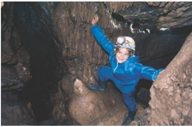
(Figure 49) Young caver in Goatchurch Cavern.