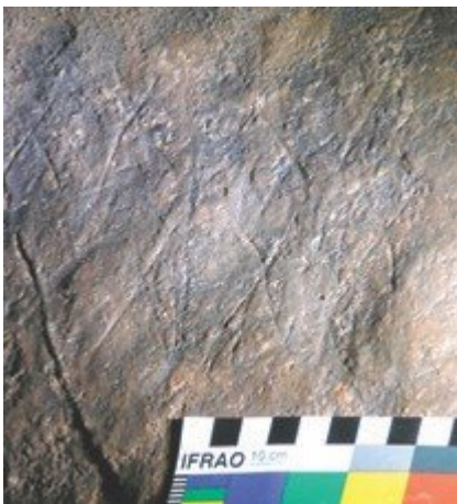
(Figure 48) Mesolithic cave art in Aveline's Hole. A series of inscribed crosses can be seen scratched into the rock.