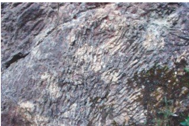
(Figure 54) The Clifton Down Limestone locally contains fossil corals such as this example of Lithostrotion, a colonial coral now extinct.