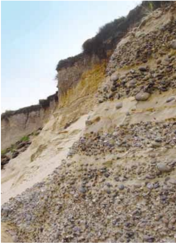
The Westleton Beds at Dunwich Heath cliffs