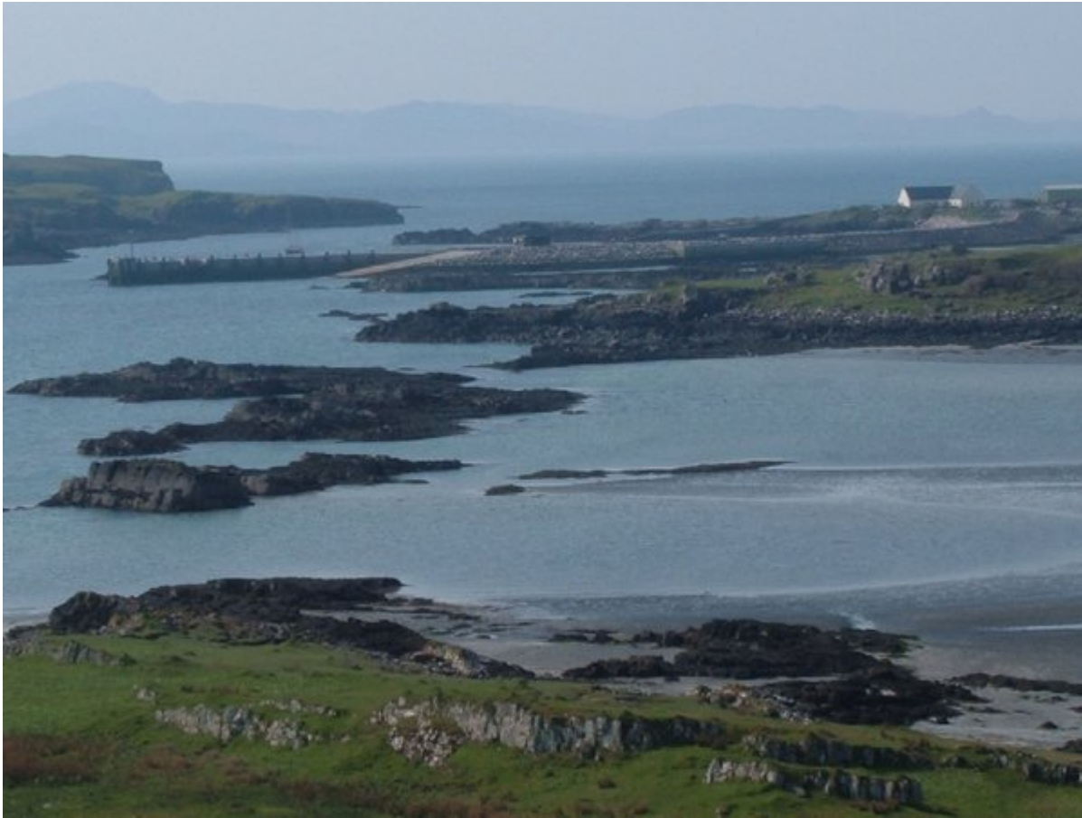
Figure 34 The view back to the pier and An Laimhrig, with Ardnamurchan beyond.