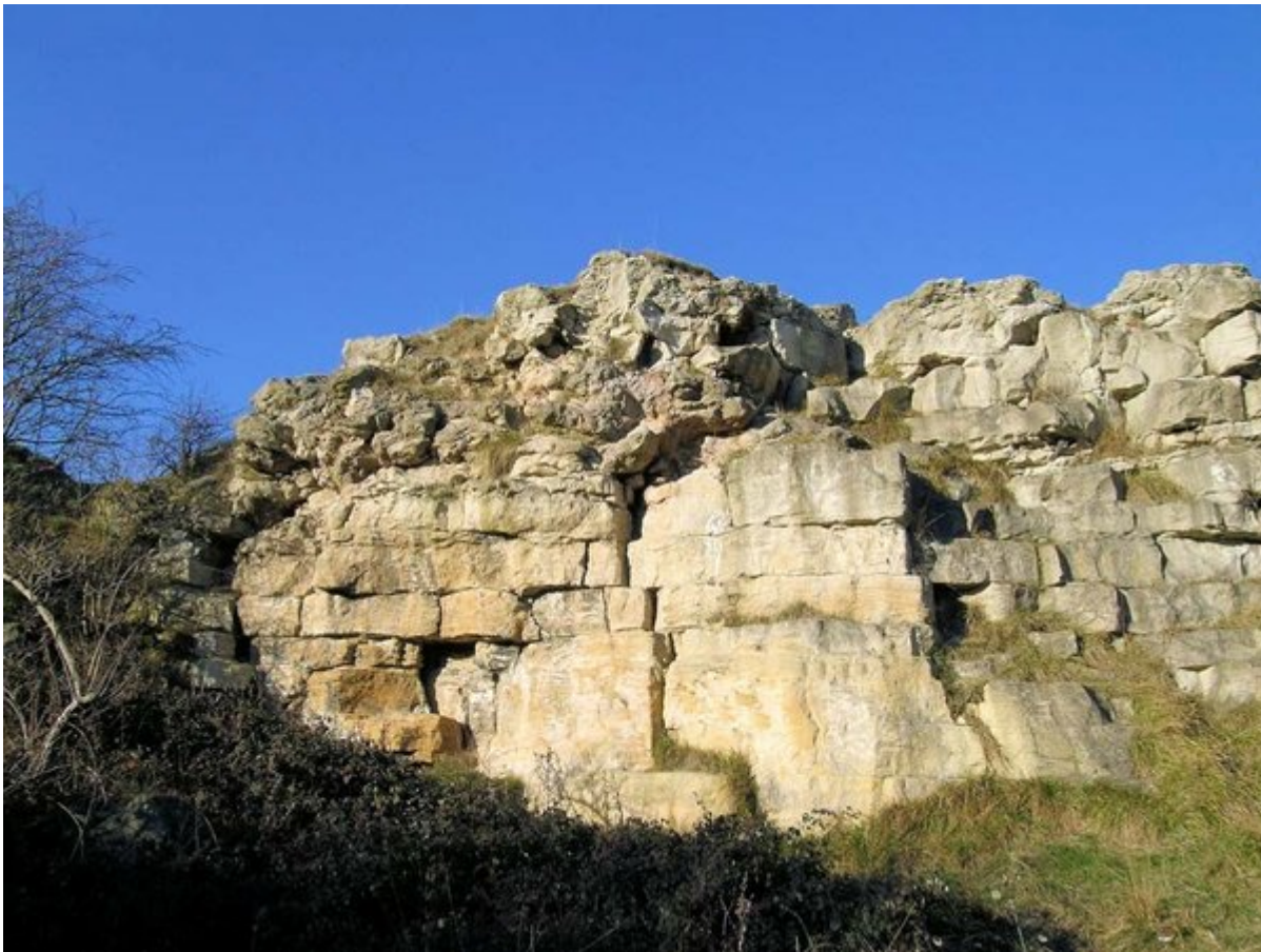
(Figure 64) Section through Bryozoan reef overlying well bedded shelly limestones in the Wetherby Member. [SK 50648 99256].