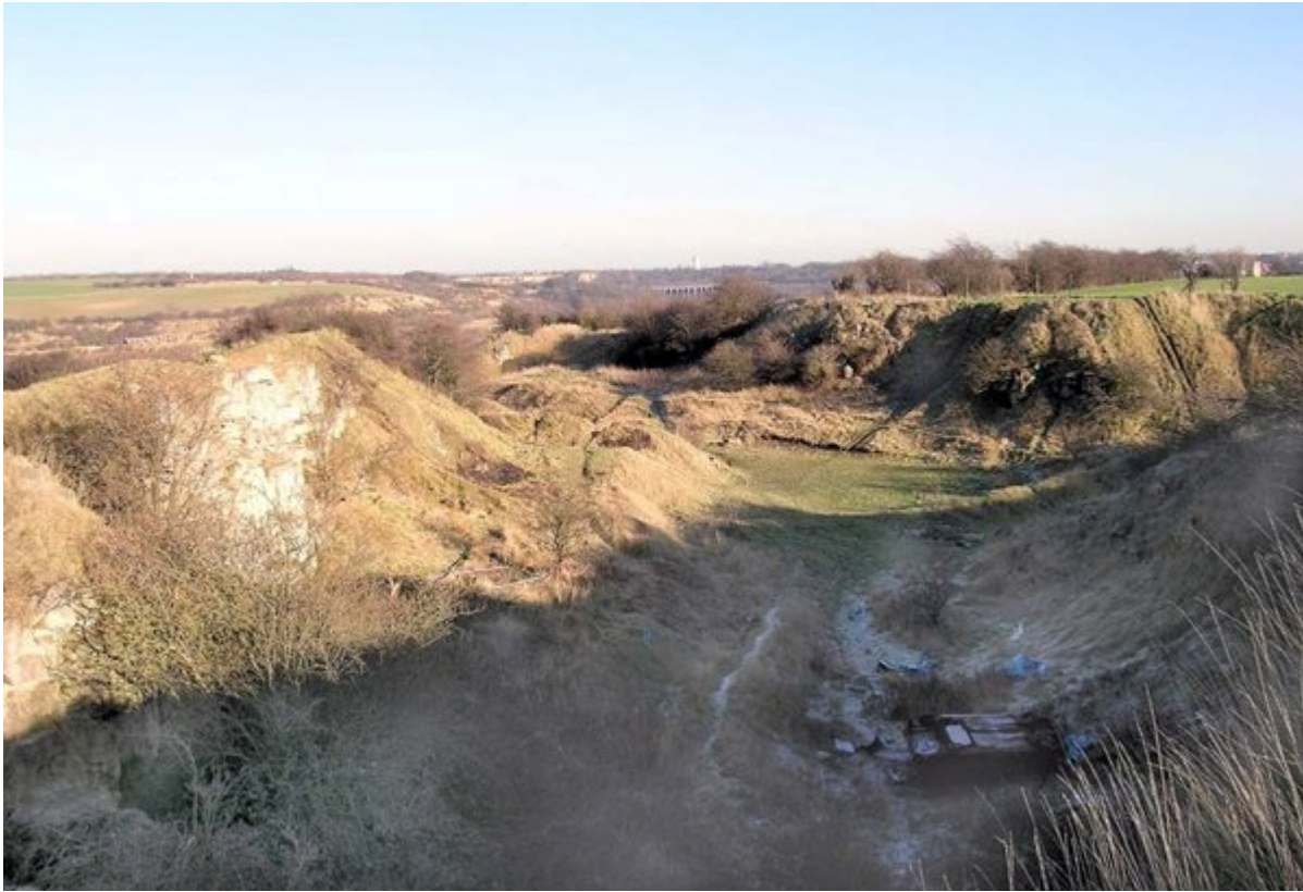
(Figure 63) General view across the quarry towards Conisbrough Viaduct to the east. [SK 50620 99250].