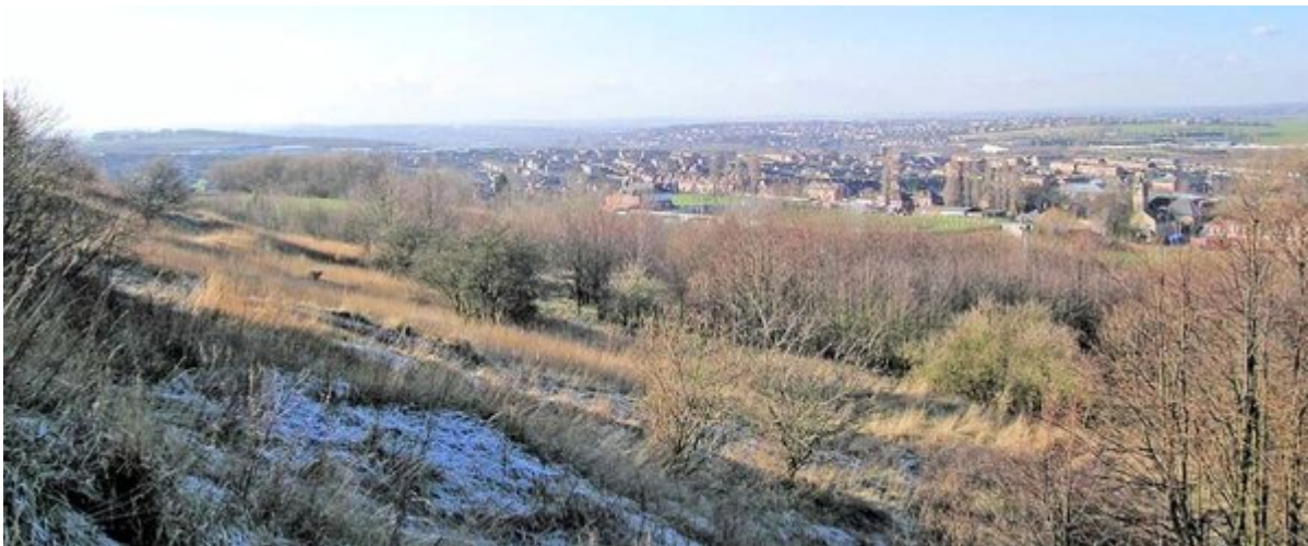
(Figure 62) View of Carboniferous scarp and dip topography across the Don Valley to the west. [SK 50500 99180].