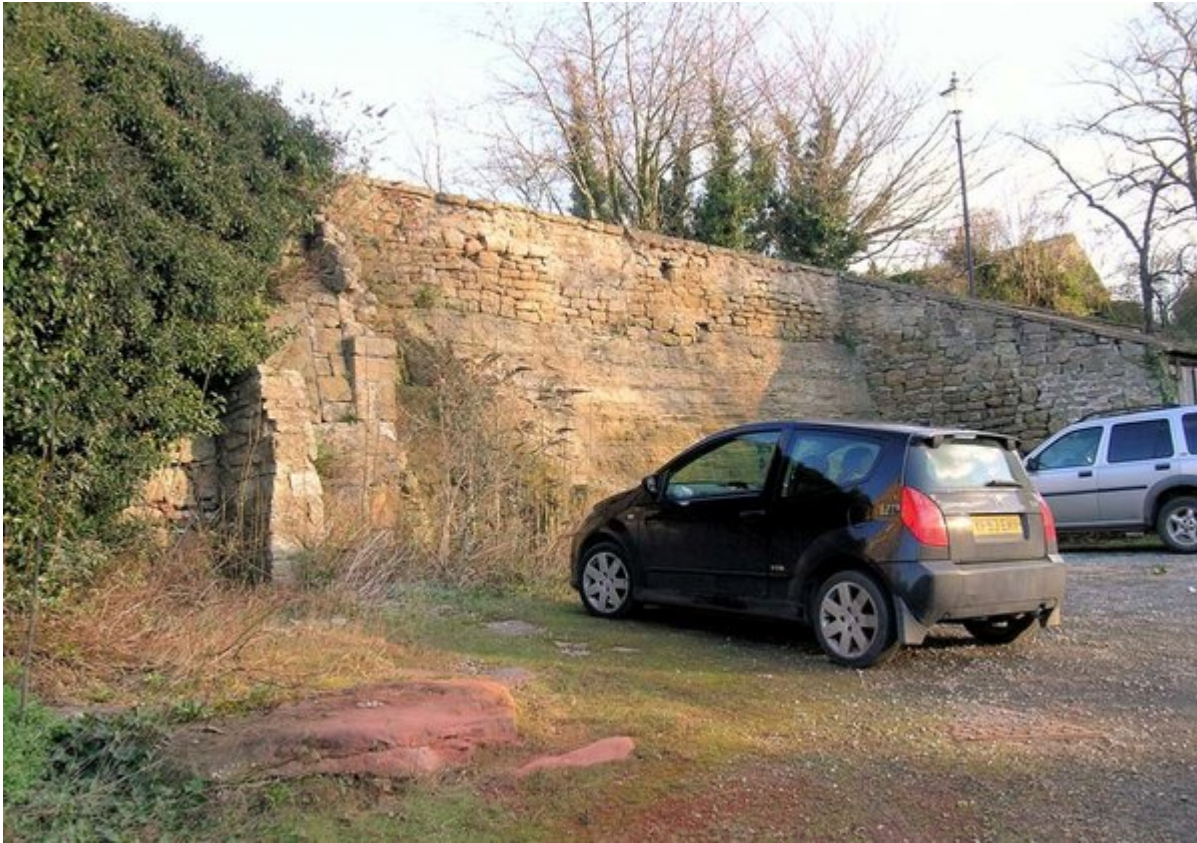
(Figure 67) General view of well bedded and sorted pisolite beds in the Wetherby Member. [SE 48551 08048].