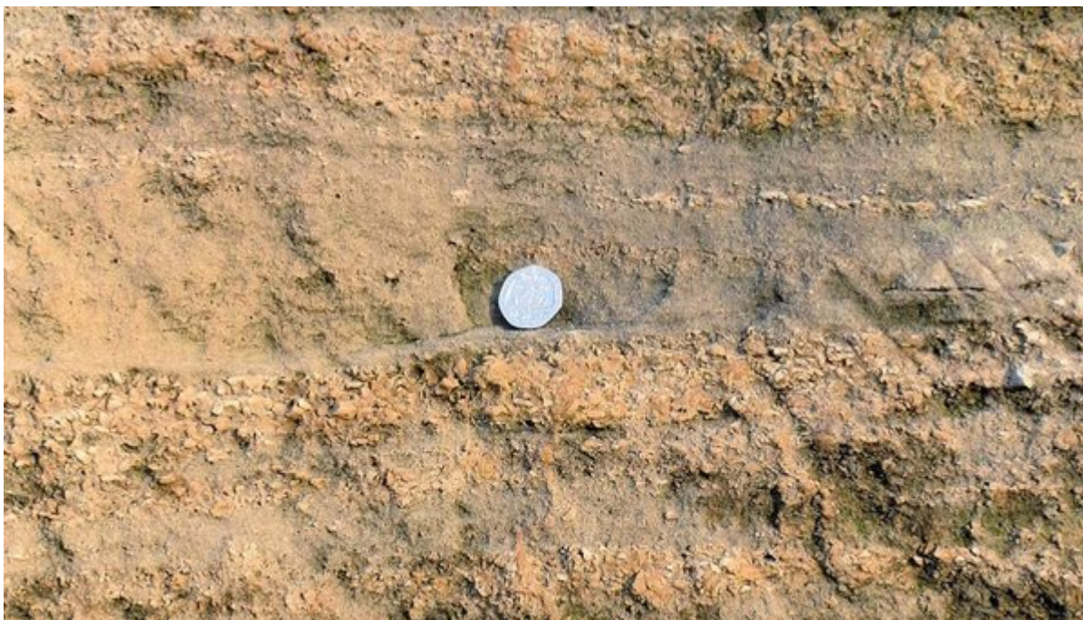
(Figure 66) Detail of well bedded and sorted pisolite beds. [SE 48551 08048].