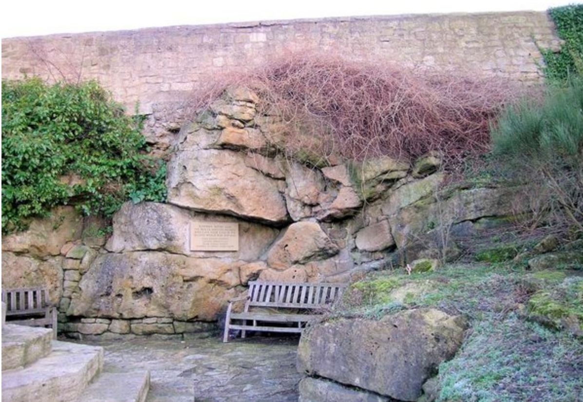
(Figure 68) General view of bryozoan reef in the Wetherby Member incorporated into War Memorial Garden. [SE 48563 08127].