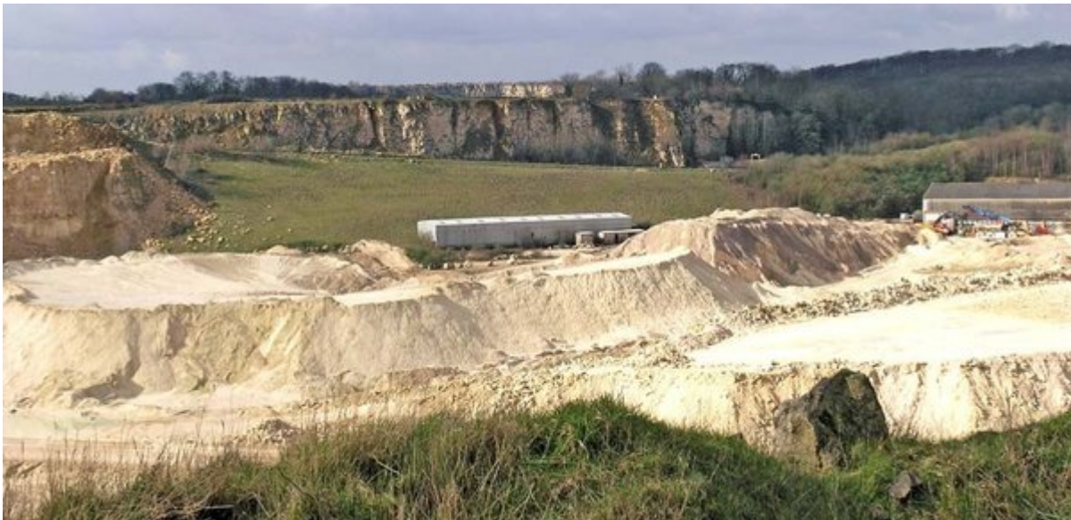
(Figure 94) General view of quarry looking to the west. [SE 53900 00400].