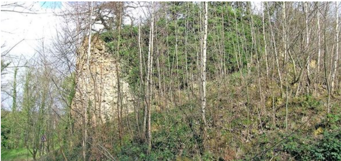
(Figure 92) General view of south face of breccia stump. [SE 53457 00488].