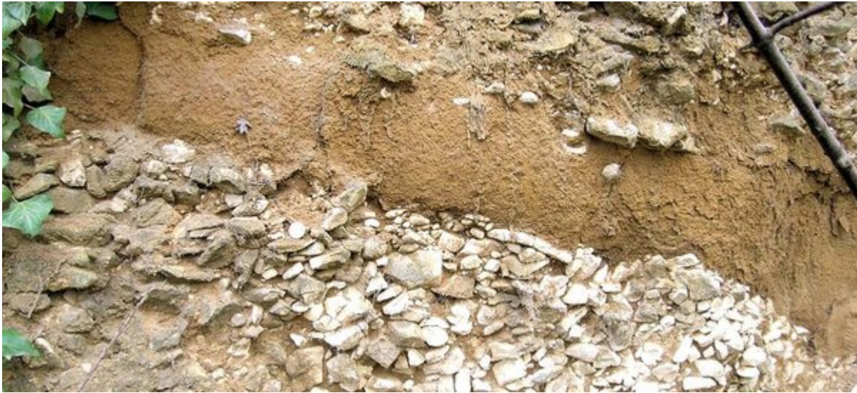
(Figure 93) Detail of sandstone and limestone layers in south face of breccia stump. [SE 53457 00488].