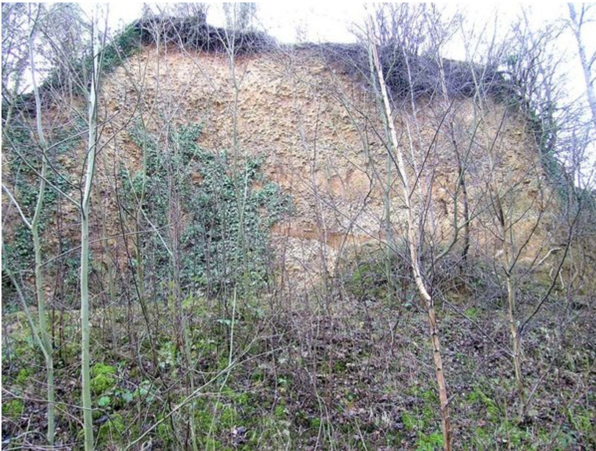
(Figure 91) General view of north face of breccia stump. [SE 53458 00455].