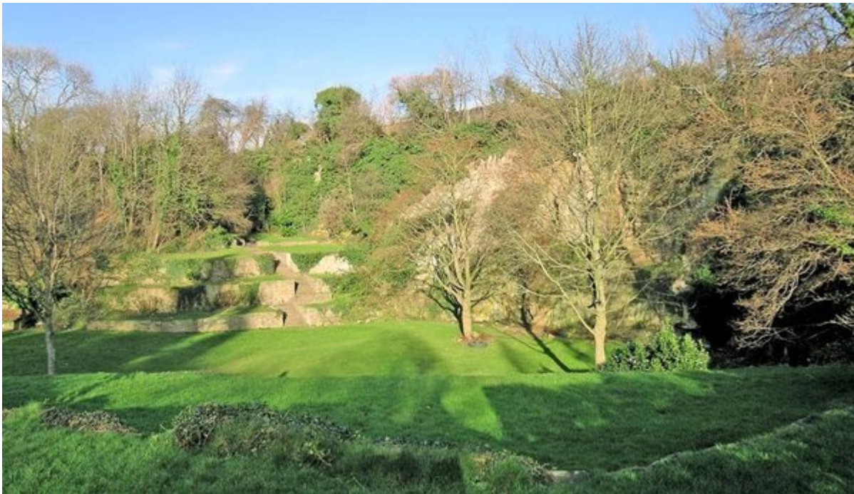
(Figure 96) General view of landscaping of the old quarry benches looking to the north. [SE 54460 00300].