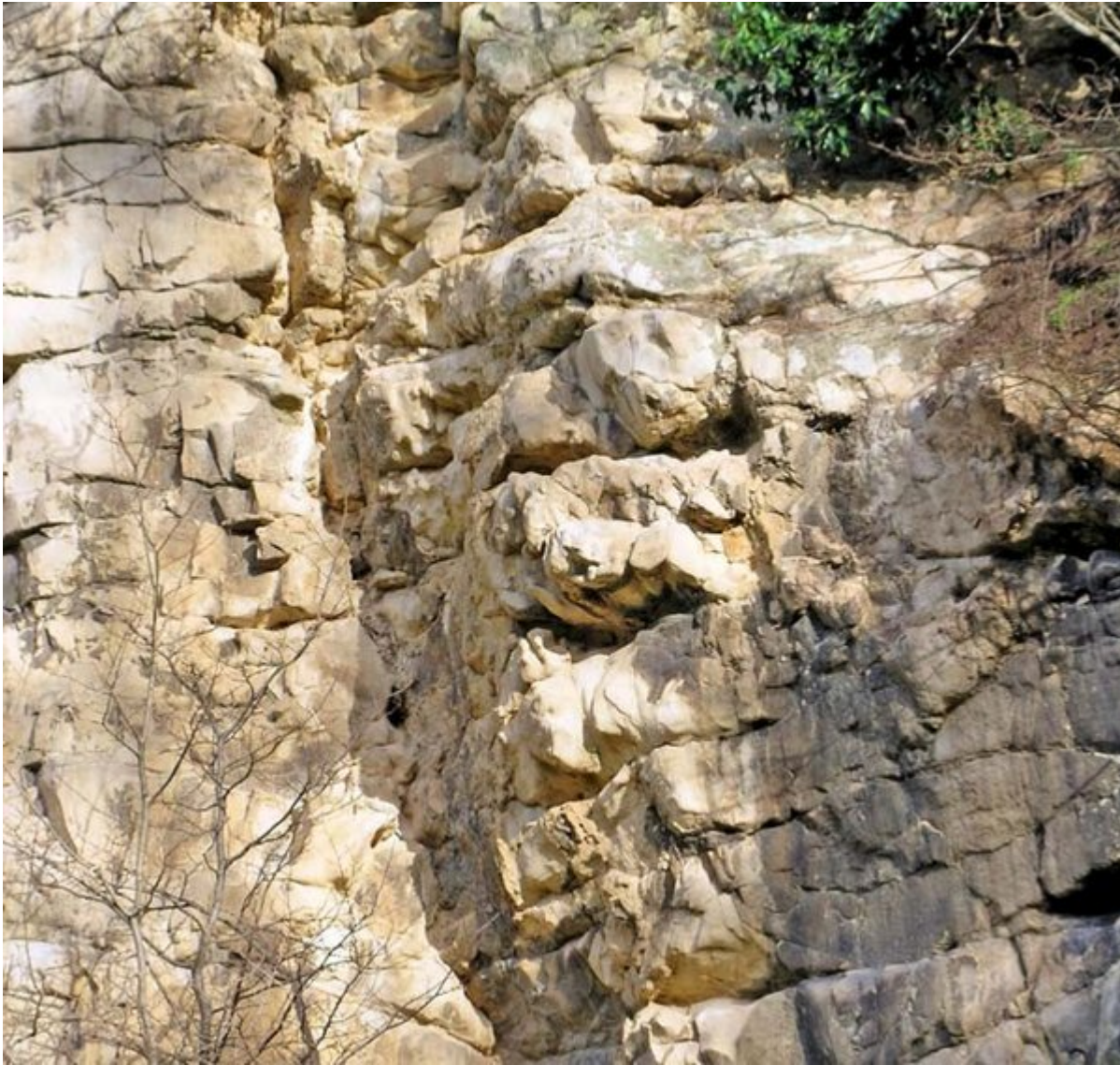
(Figure 98) Development of a sink hole and solution features along a joint in the eastern face of the quarry. [SE 54470 00370].