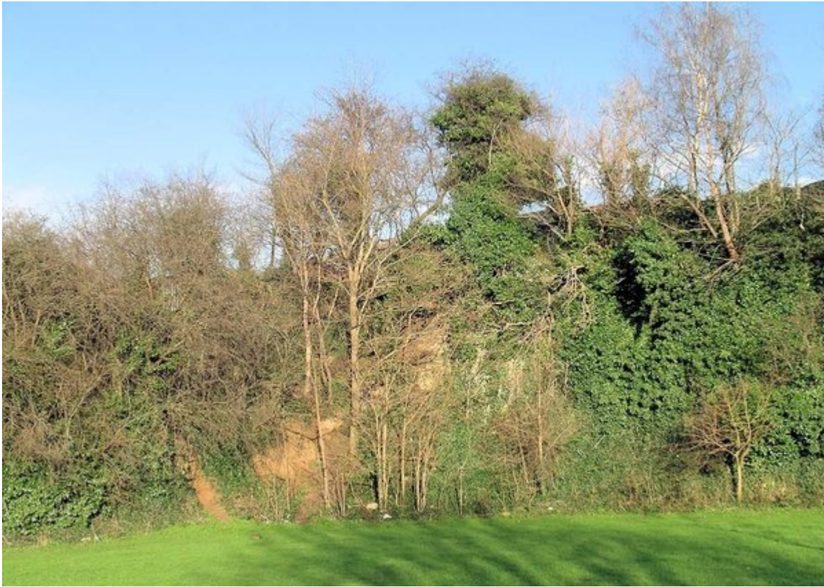
(Figure 97) General view of till (left) and limestones of the Sprotbrough Member (right). [SE 54470 00305].