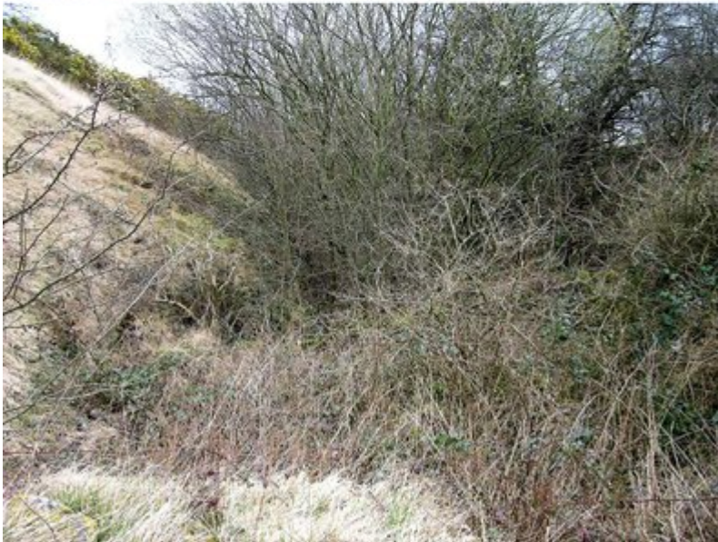
(Figure 112) Eastern access to Cadeby Pot. [SK 51800 99060]. Western access to Cadeby Pot. [SK 51400 99070]