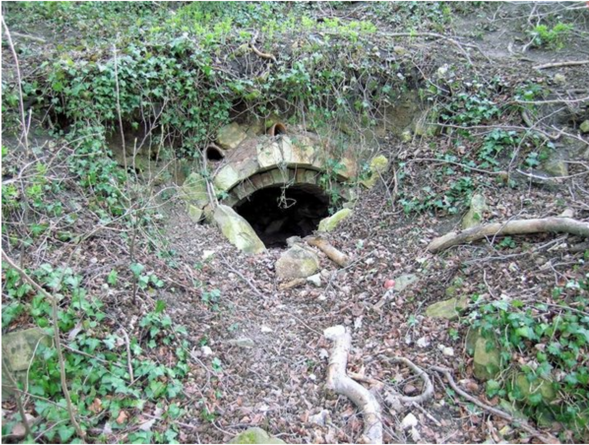
(Figure 117) General view of cave entrance from 1997 survey. [SE 53784 01029].