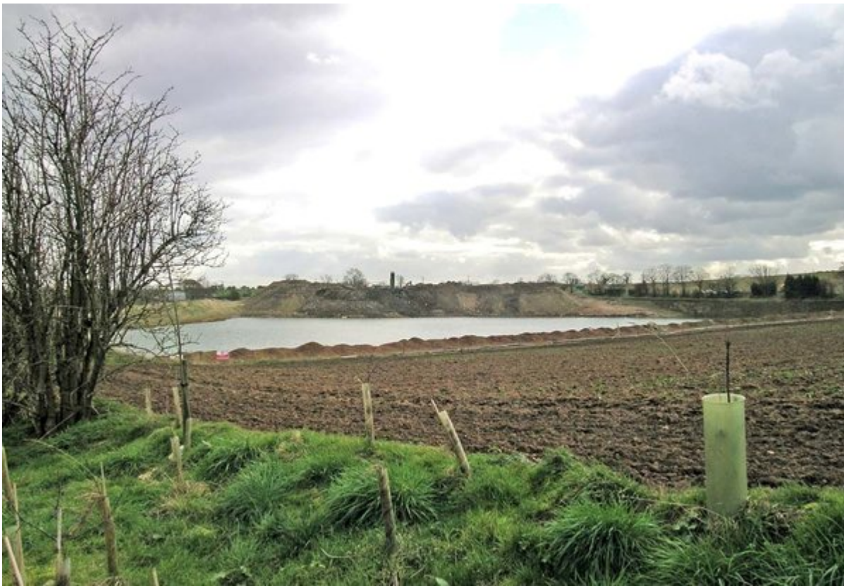
(Figure 134) General view of restoration and tree planting works. [SE 51116 11573].