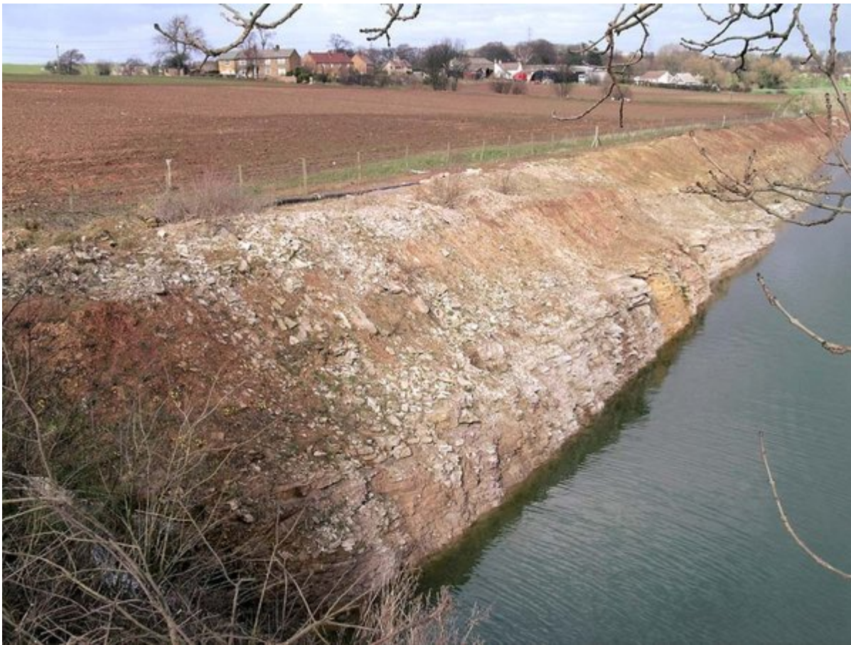
(Figure 135) Last remaining exposure of limestones of the Brotherton Formation and overlying Roxby Formation. [SE 51116 11573].