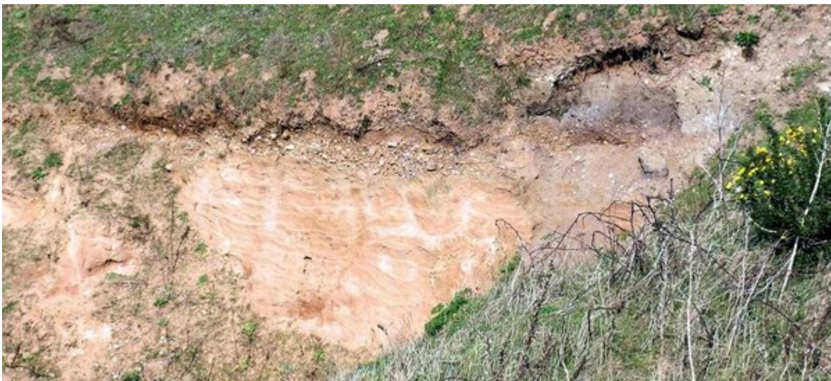
(Figure 147) Cryoturbated Older River Gravel. [SE 65775 07817].