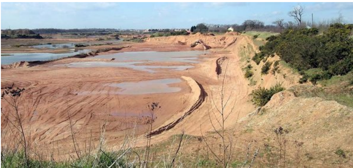
(Figure 144) General view of Sherwood Sandstone to north quarry face. [SE 65775 07817].