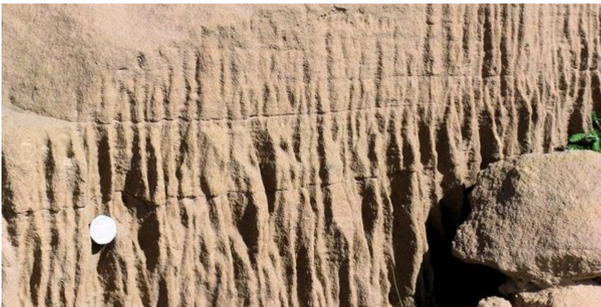
(Figure 146) Exposed joint plane in Sherwood Sandstone, showing erosional surface. [SE 65230 07820].