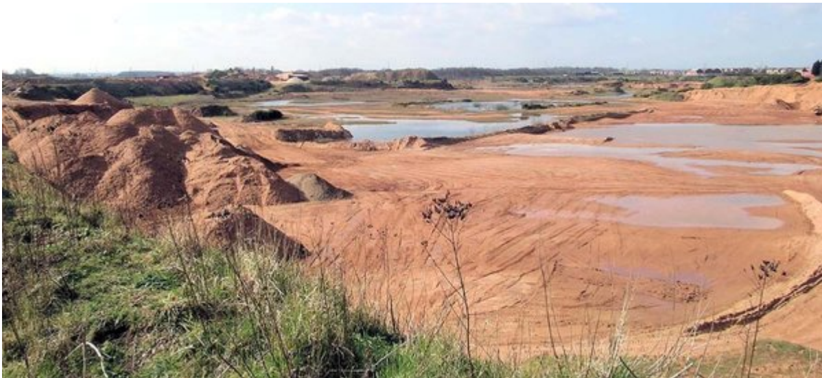
(Figure 143) General view to south west from quarry entrance. [SE 65775 07817].