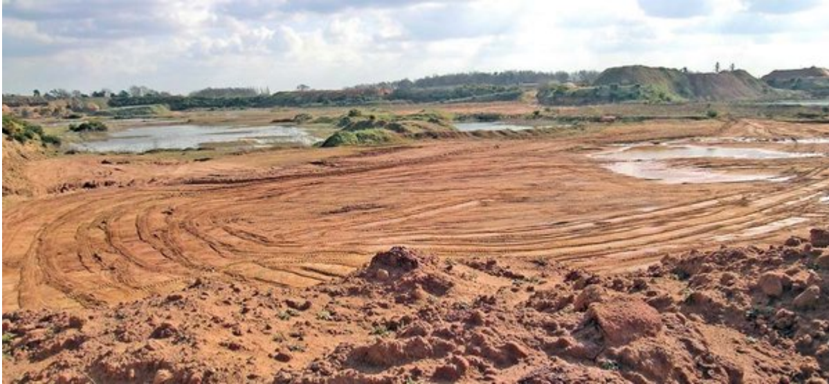
(Figure 142) General view to the west. [SE 65175 07905].