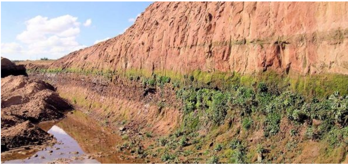
(Figure 145) Development of spring line along a bed of marl in Sherwood Sandstone. [SE 65237 07846].