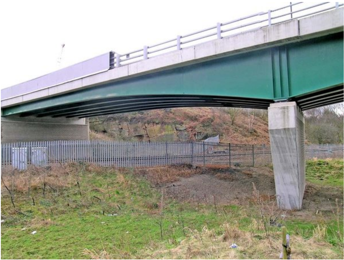
(Figure 19) Flyover obscuring outcrop of Mexborough Rock. [SK 49300 99840].