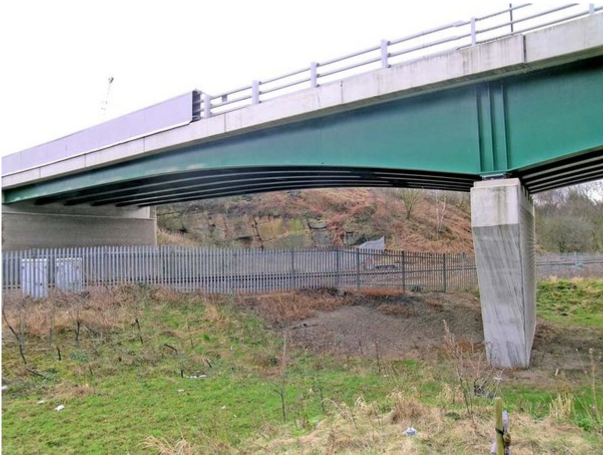
(Figure 19) Flyover obscuring outcrop of Mexborough Rock. [SK 49300 99840].