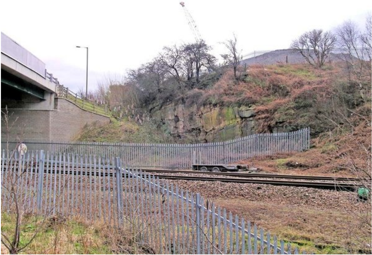
(Figure 20) Remaining outcrop of Mexborough Rock. [SK 49300 99840].