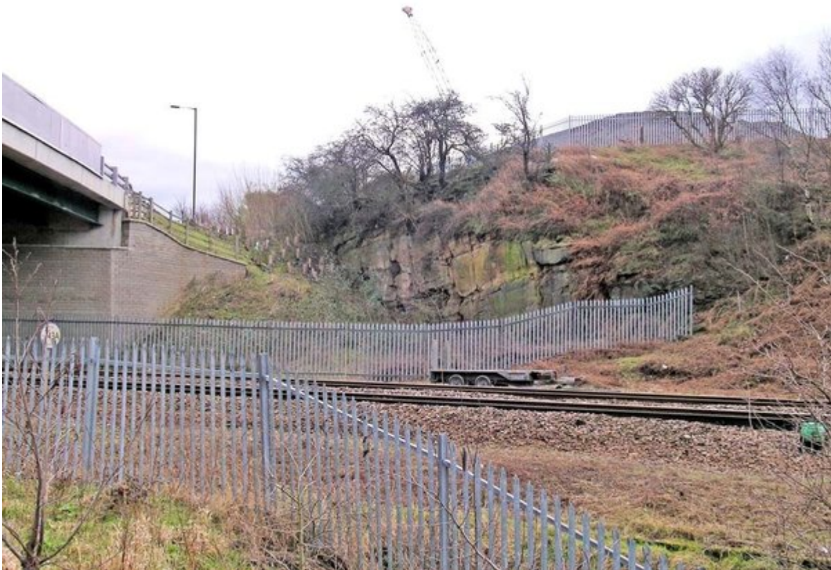
(Figure 20) Remaining outcrop of Mexborough Rock. [SK 49300 99840].