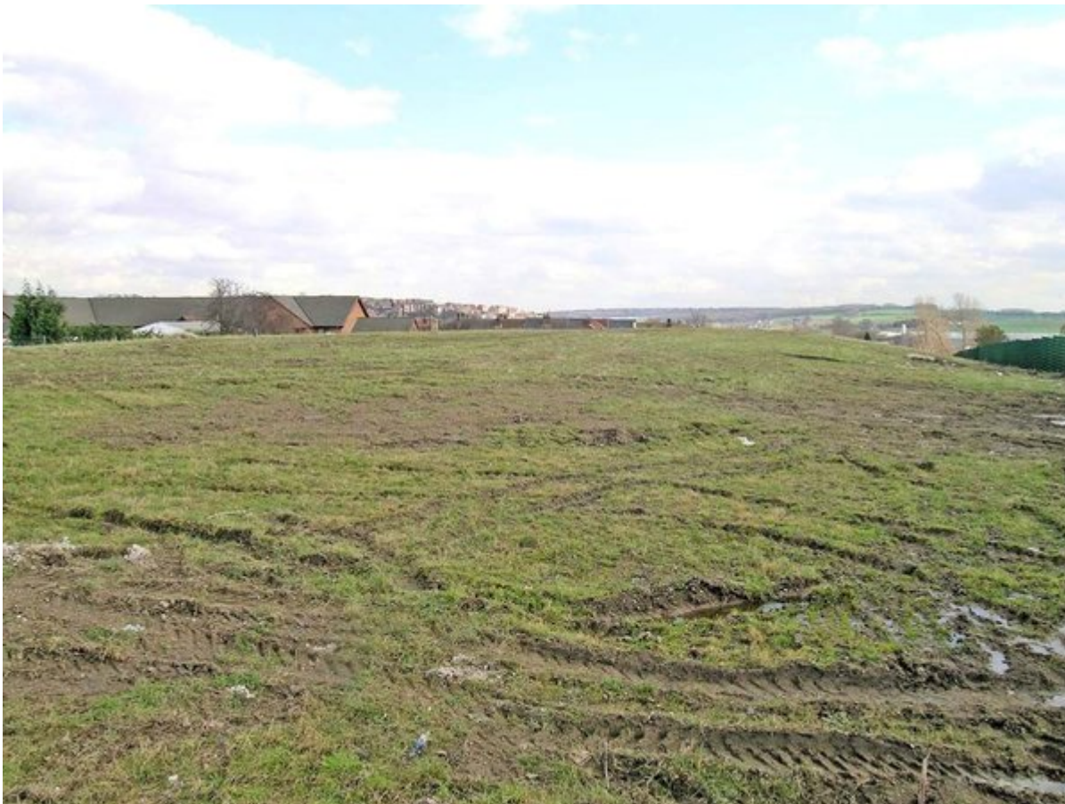
(Figure 22) General view to the east. [SE 46116 00093].