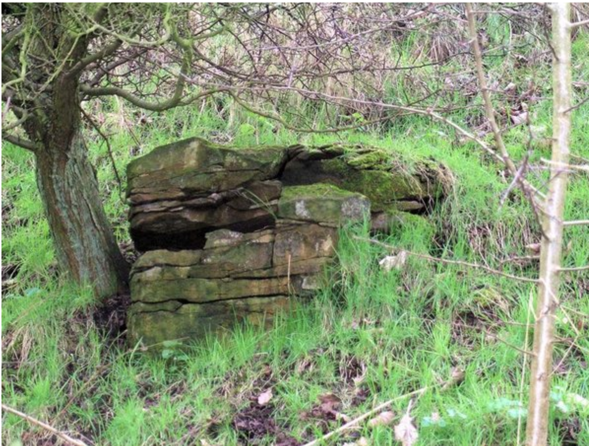
(Figure 25) Exposure B. Cross bedded sandstone. [SE 47934 03075].