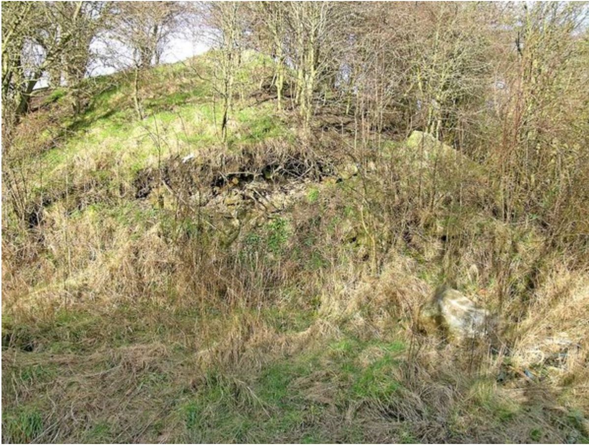
(Figure 24) Exposure A. Massive Ackworth Rock overlain by flaggy rock and soil in embankment. [SE 47721 03309].