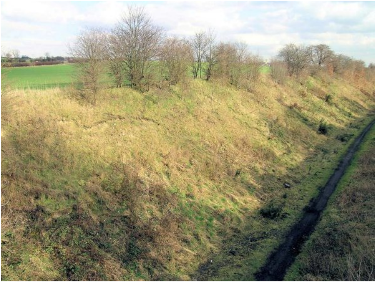
(Figure 26) General view of cutting from Green Lane. [SE 47474 03597].