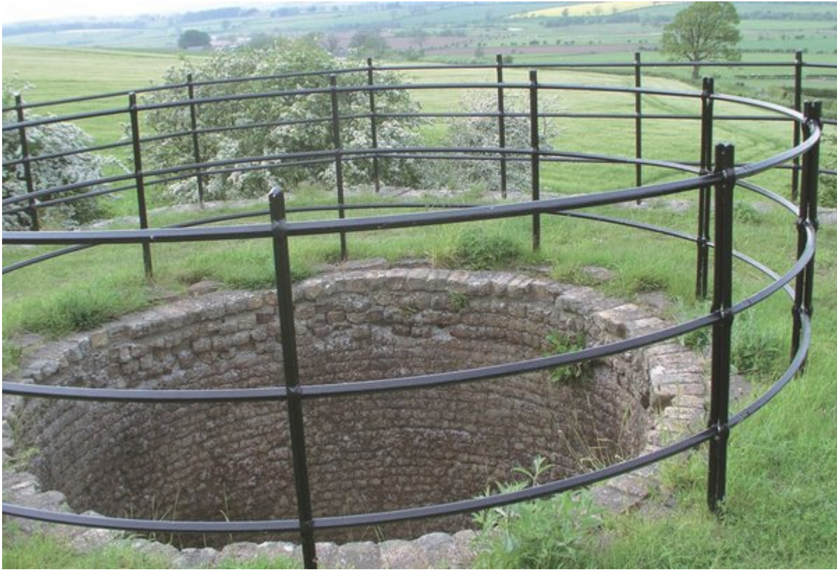
(Figure 84) The opening into the pot at Great Tosson Limekiln.