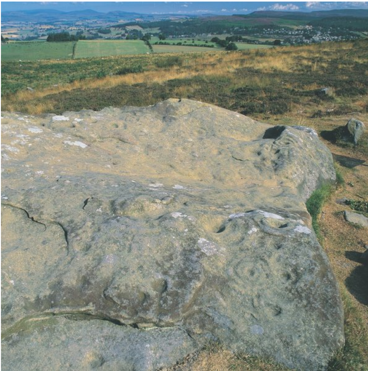
(Figure 83) The Lordenshaw rock, a panel of rock art cut into the Fell Sandstone; looking north-west towards the Cheviots