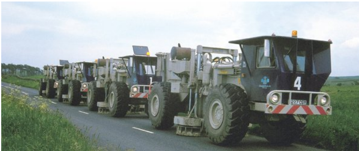
(Figure 80) Vibrator vehicles operating in Northumberland during a seismic survey in the late 1980s. Large pads are lowered onto the road surface and a radio signal is sent which induces a vibration into the ground from each pad.