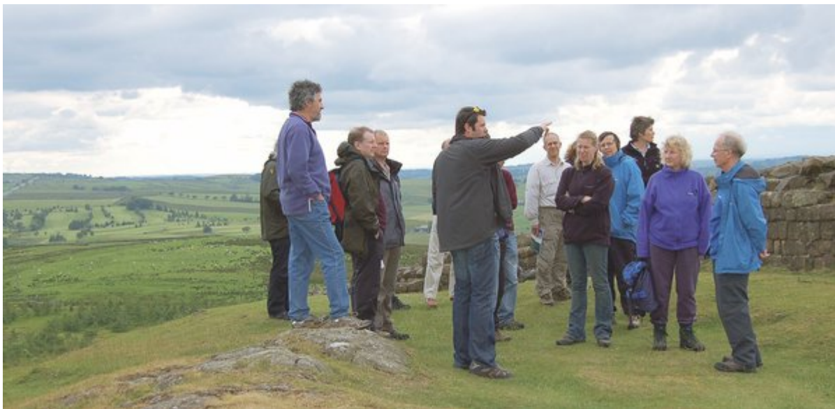
(Figure 81) Guided walk exploring the landscape above Walltown © NNPA.