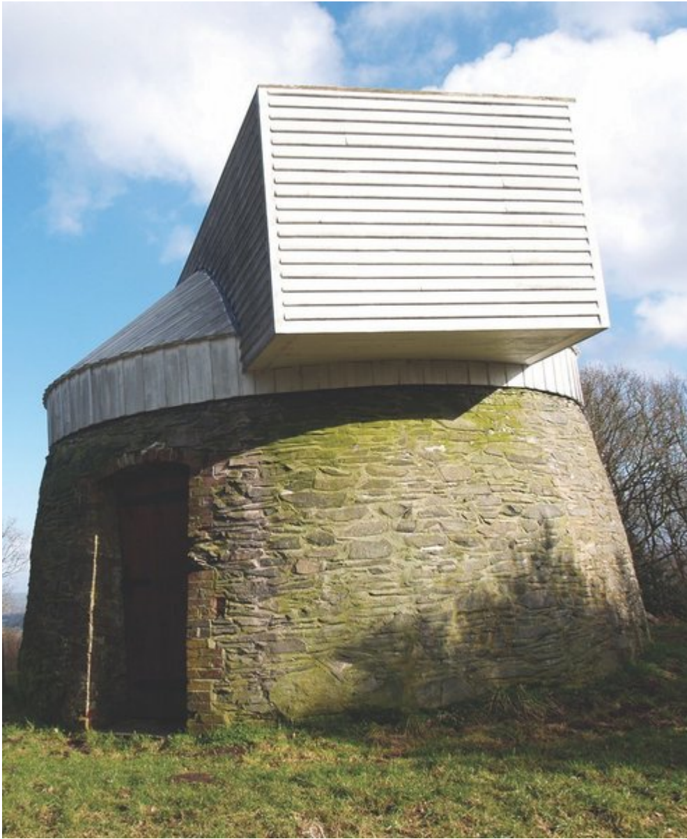
(Figure 77) Windmill at the top of Windmill Hill, Woodhouse Eaves.