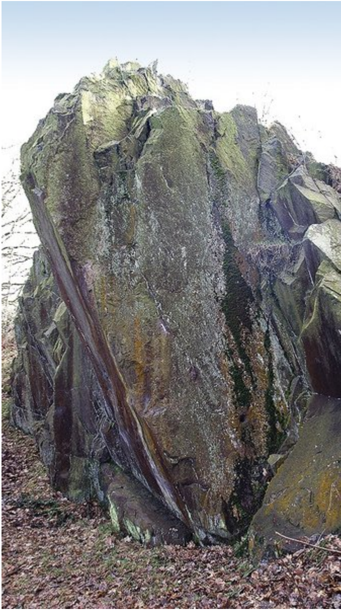
(Figure 79) Charnian tuffs exposed at the top of Windmill Hill.