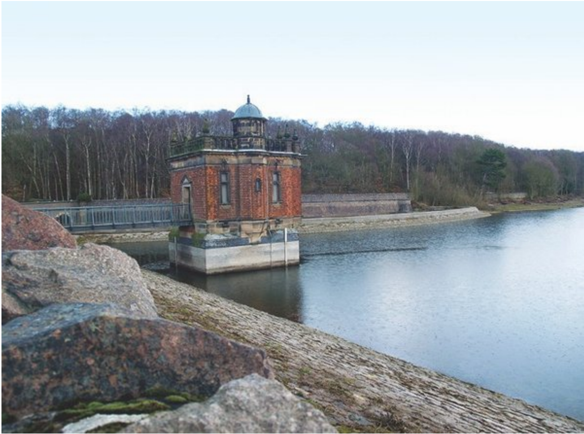
(Figure 80) Swithland Reservoir dam. Note the block of Mountsorrel granodiorite in the foreground.