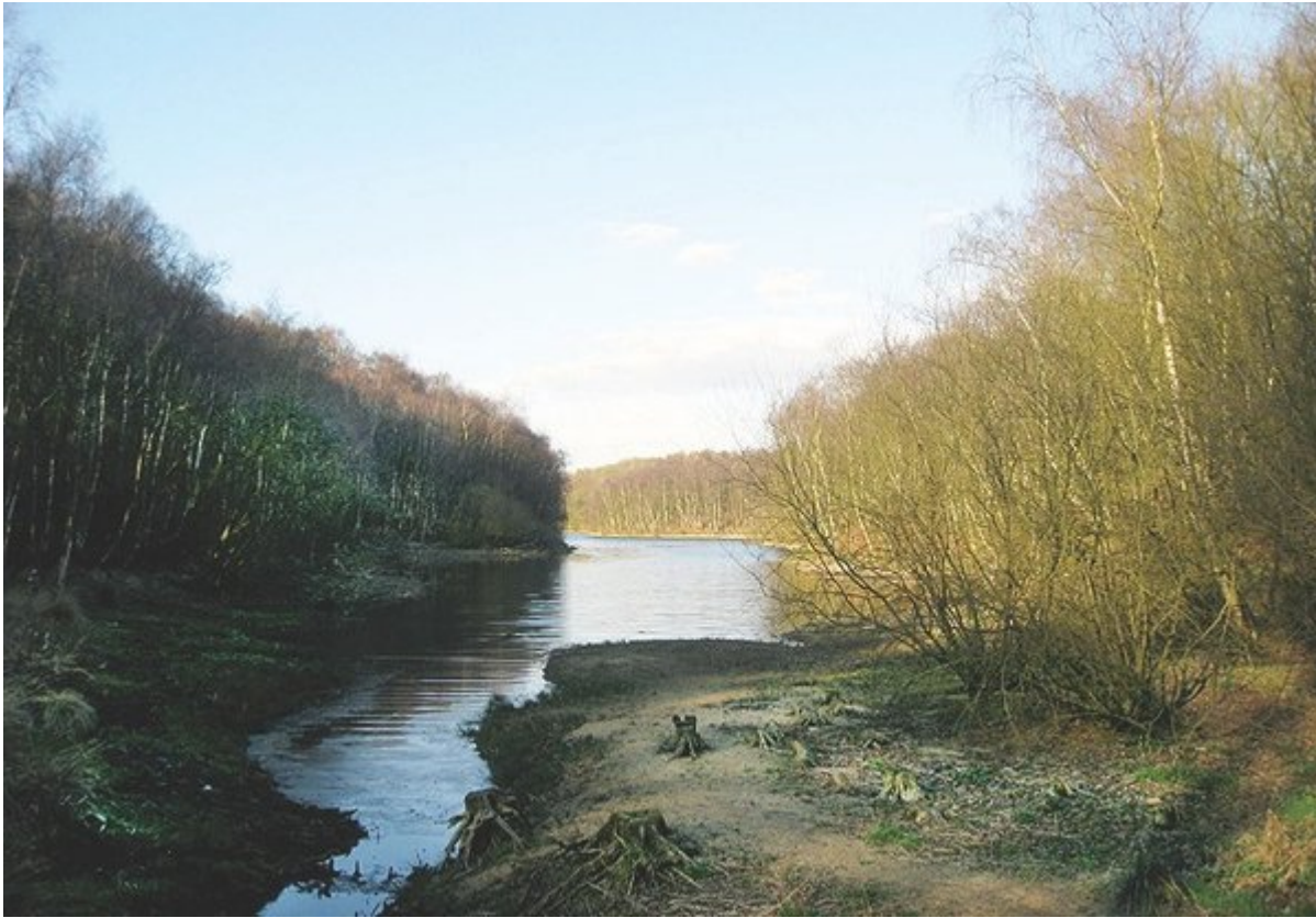
(Figure 89) The southern end of Foremark Reservoir near carver;s Rock.