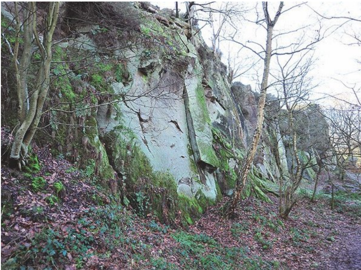
(Figure 87) Carver's Rocks.