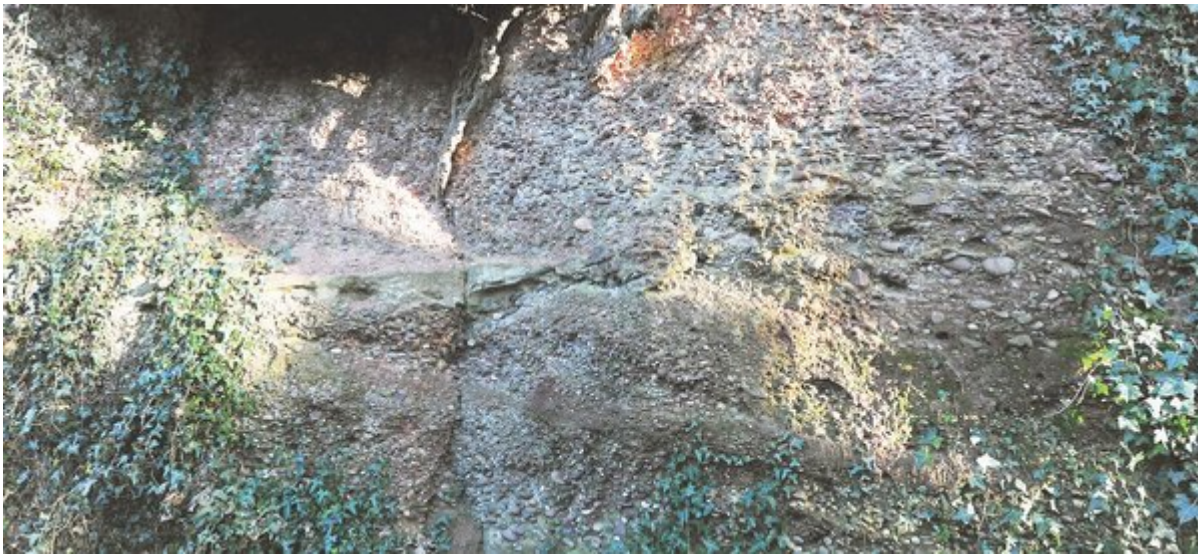
(Figure 90) Kidderminster Formation in the road cutting.