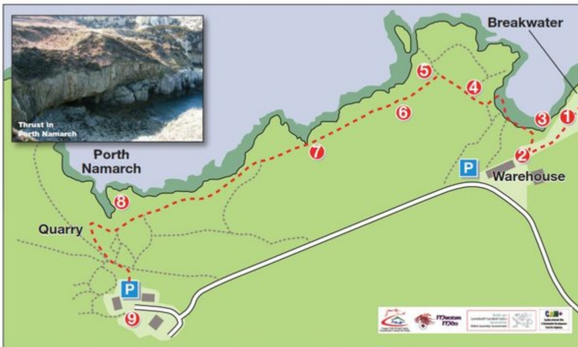
Holyhead breakwater route map. Inset: Thrust in Porth Namarch.