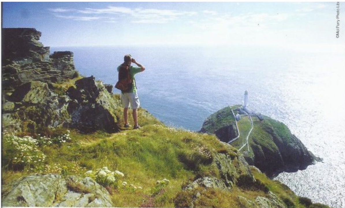
Looking down to South Stack lighthouse.