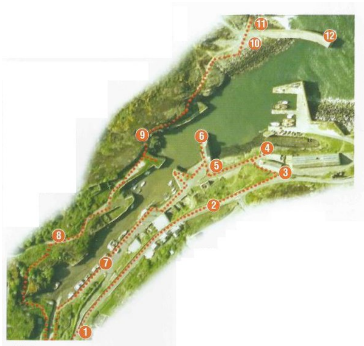
Route map. Porth Amlwch Geotrail.