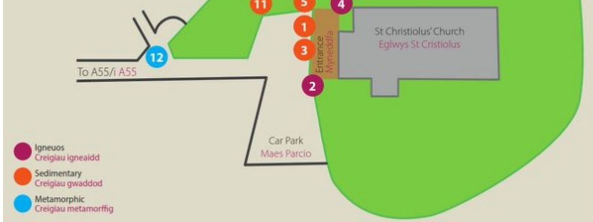
Route map. Eglwys St. Cristiolus Church Llangristiolus.

Start outside the wrought iron entrance gates to the church graveyard.