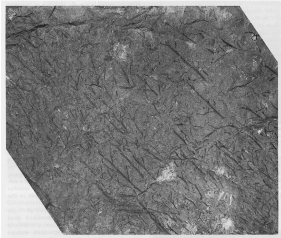
(Figure 4.18) Gosslingia breconensis Heard. Branched axes with some lateral sporangia; Natural History Museum, London, specimen V.26575. Senni Beds (Siegenian), Craig-y-Fro Quarry. x 0.5.