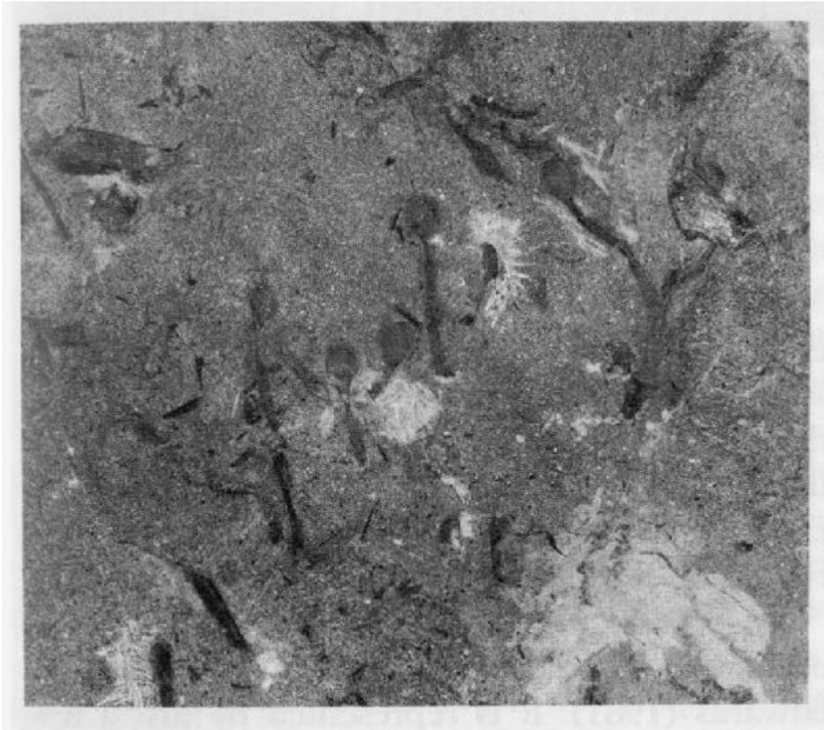
(Figure 4.17) Uskiella spargens Shute and D. Edwards. Branched axes bearing terminal sporangia; Natural History Museum, London, specimen V.26461a. Senni Beds (Siegenian), Craig-y-Fro Quarry. x 1.