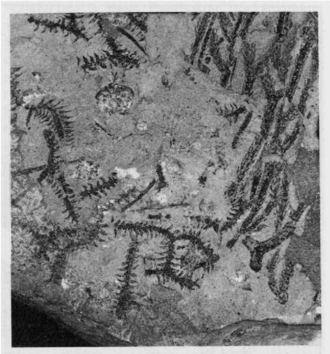
(Figure 5.40) Archaeosigillaria stobbsii Lacey. Lower Carboniferous lycopsid leafy shoots; Natural History Museum, London, specimen V.16012. Foel Formation (Chadian), Moel Hiraddug. x 1.