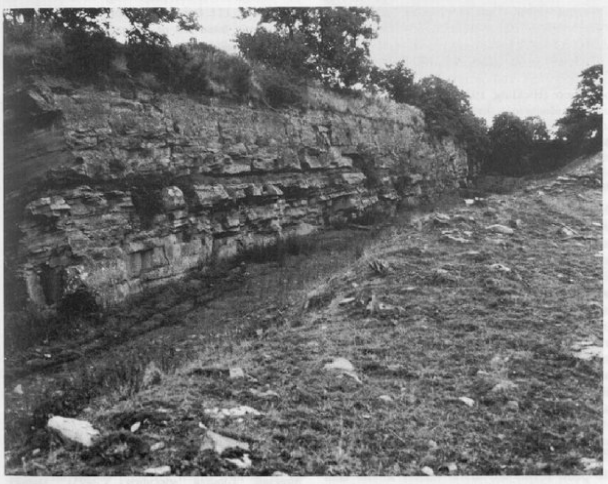
(Figure 4.10) Turin Hill, Aberlemno Quarry. Strike section along flaggy deposits of the Gedinnian Dundee Formation.