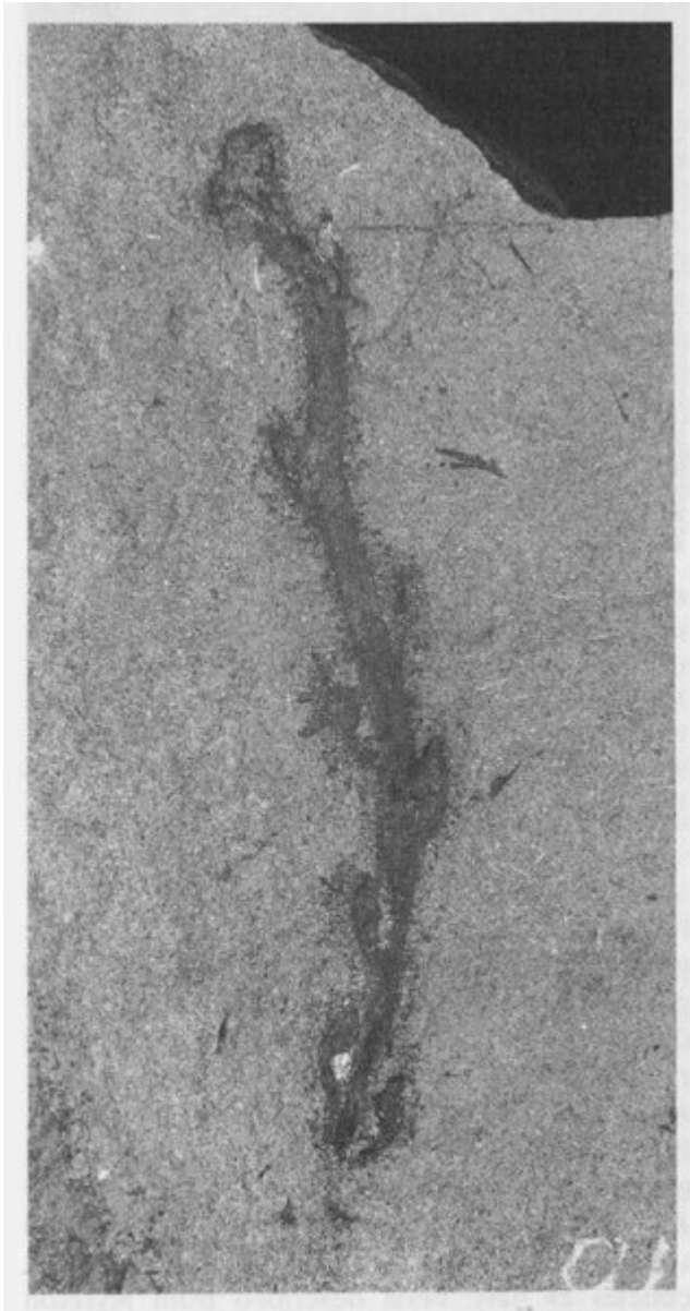
(Figure 4.13) Zosterophyllum myretonianum Penhallow. A fertile spike with sporangia arranged around the axis; Natural History Museum, London, specimen V.58047. Dundee Formation (Gedinnian), Clocksbriggs Quarry, Turin Hill. x 2.