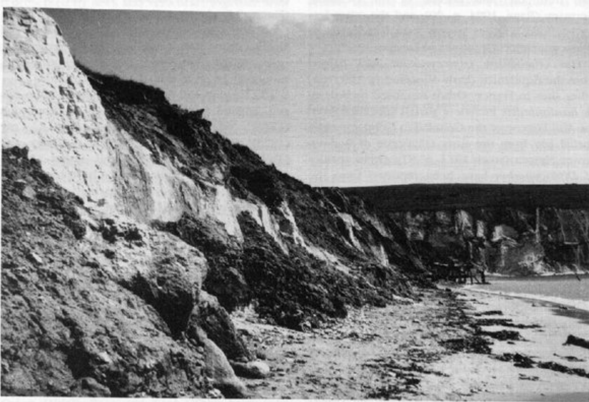
(Figure 9.8) Alum Cliff, at the southern end of the Headon Beds outcrop on Headon Hill, Isle of Wight.