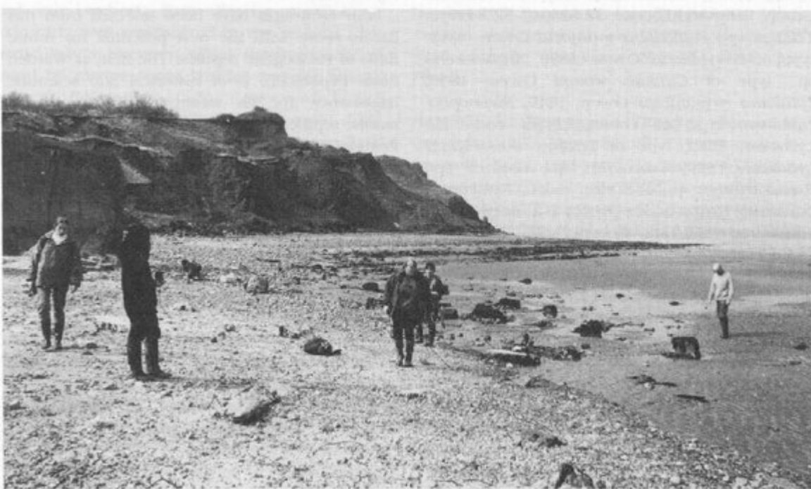
(Figure 9.3) The London Clay, exposed at Warden Point, Isle of Sheppey, showing collapsed cliffs and fossil-bearing material on the foreshore.