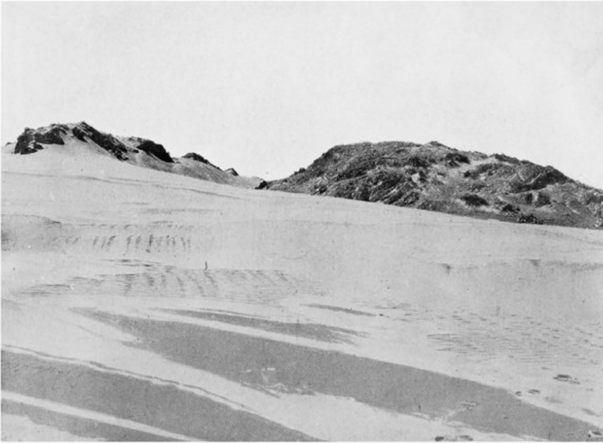
(Plate 49) Desert scenery. Dunes of Newborough.