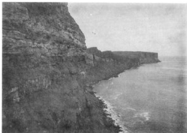
A. BEARRERAIG BAY, 6½ MILES NORTH-NORTH-EAST OF PORTREE Columnar sill of dolerite overlying Inferior Oolite