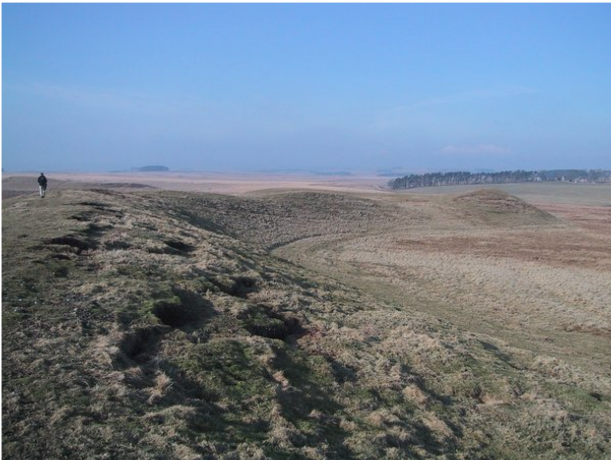
Figure 3f: view from east along west end of Long Kaim.