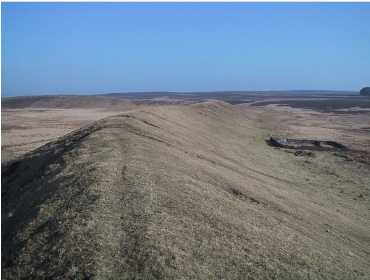
Figure 3d: view from west along the flat top of the central section of the Bedshiel Kaims in the vicinity of Fangrist Burn.