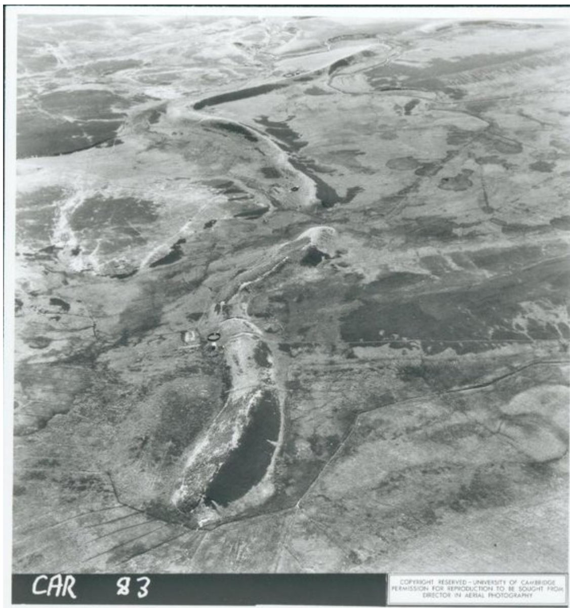
Figure 2c: oblique aerial photograph of the Bedshiel Kaims viewed from the east.