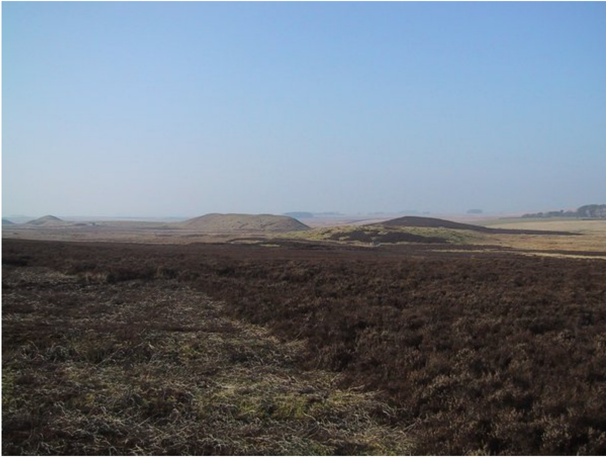
Figure 3a: view of Horse Kaim from the east.