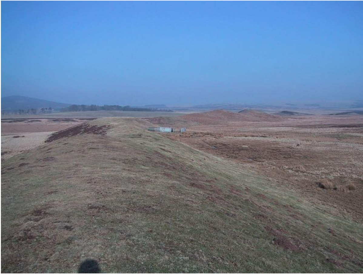
Figure 3c: view from west along flat top of Green Kaim.