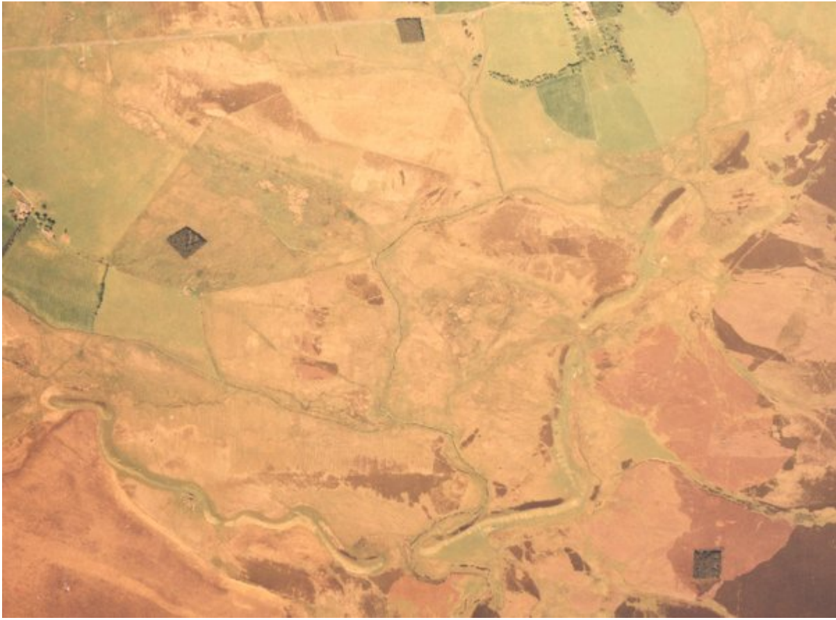
Figure 2a: vertical aerial photograph of the Bedshiel Kaims showing the whole landform.