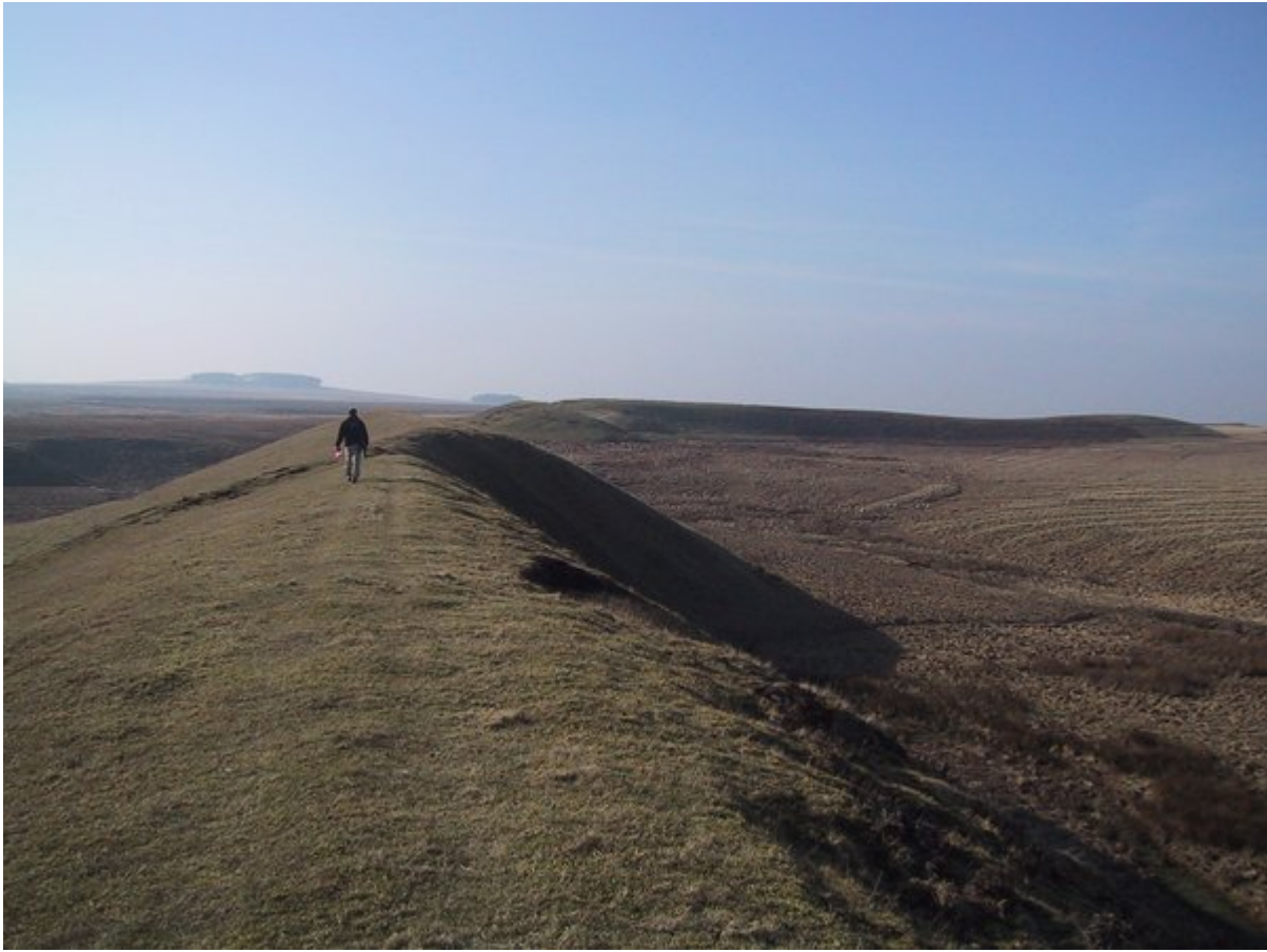
Figure 3e: view from east along Long Kaim.