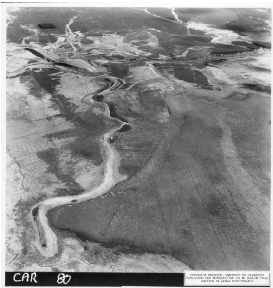
Figure 2b: oblique aerial photograph of the Bedshiel Kaims viewed from the west.