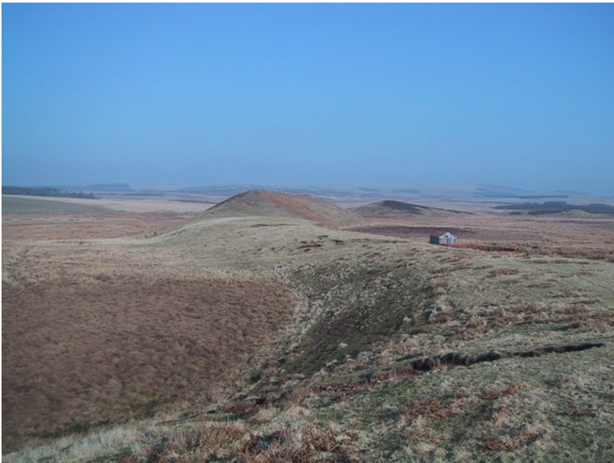
Figure 3b: view from west along Green Kaim and Horse Kaim, showing flat-crested sections separated by isolated mounds.