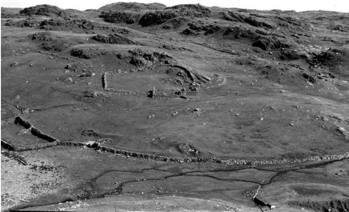
(Plate 5A) General view of Neeans, looking east from north-east slope of Crockna Vord. [HU 257 583]. Characteristic topography formed by the metamorphic rocks of the Neeans Group. (D950).