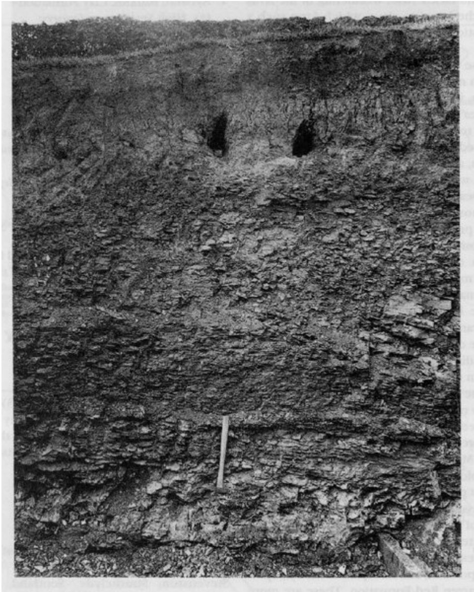
(Figure 12.3) Opencast in bauxitic clay at High Smithstone.