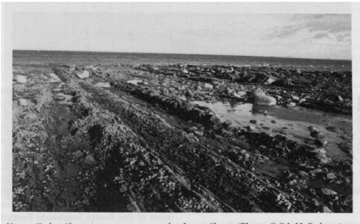
(Figure 12.6) Upper Carboniferous sequence exposed at Joppa Shore.